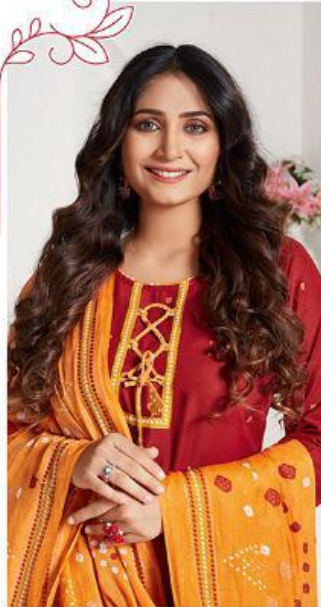
The Blast of bright colors-one of this season's most favorite fashion trends