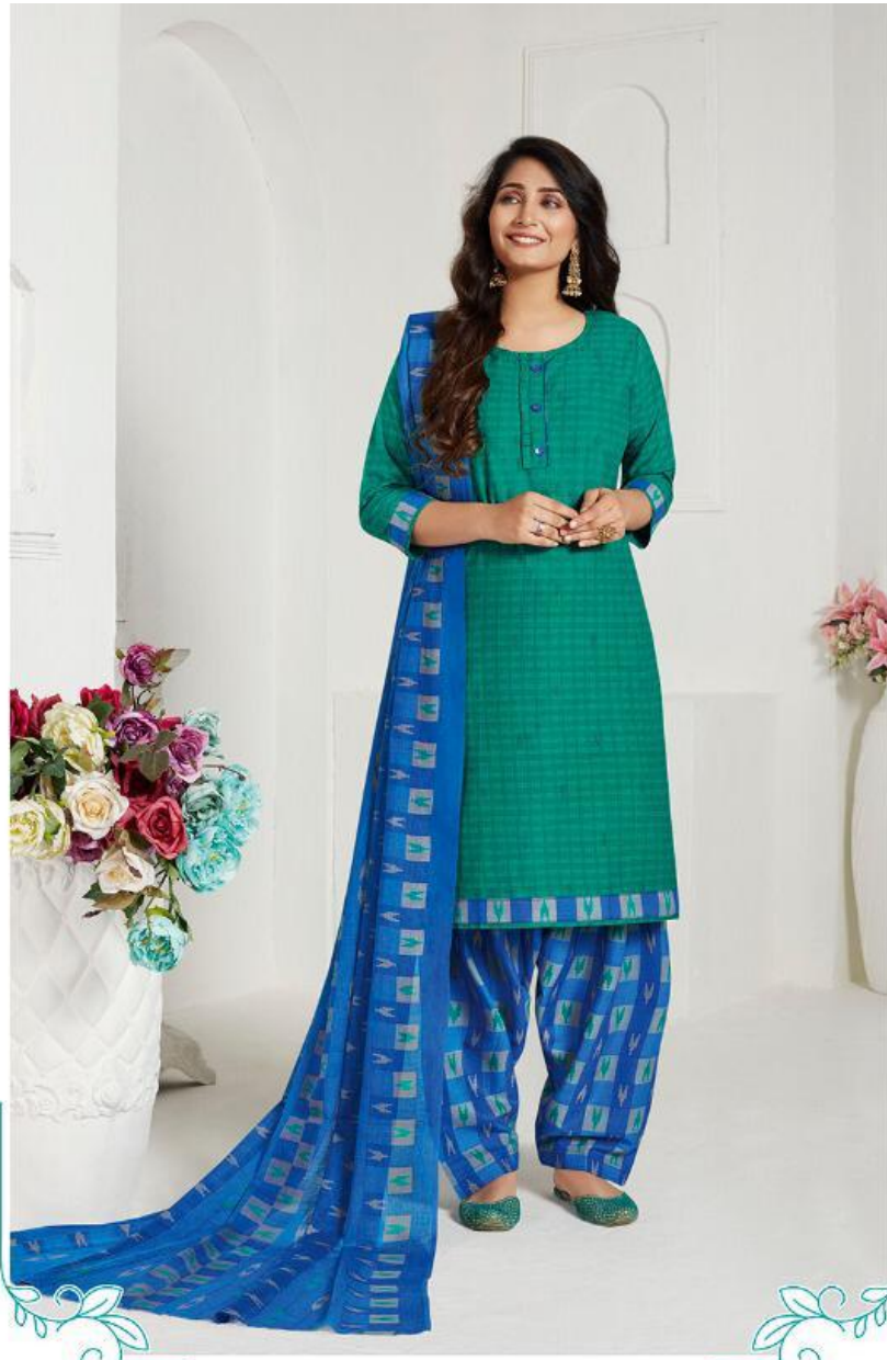
Fashionable tributes to color & silhouettes that have inspired trends around the world.