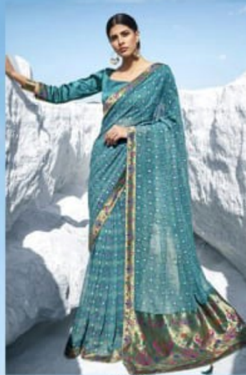
— 26493 —