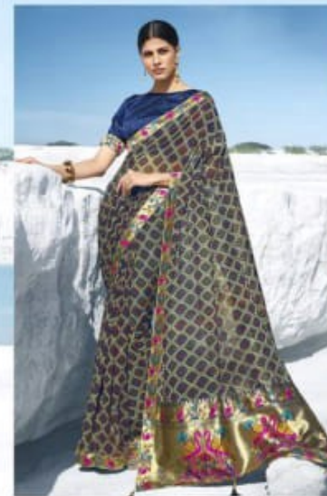
— 26498 —