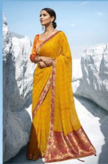
— 26492 —