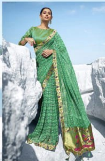
— 26497 —