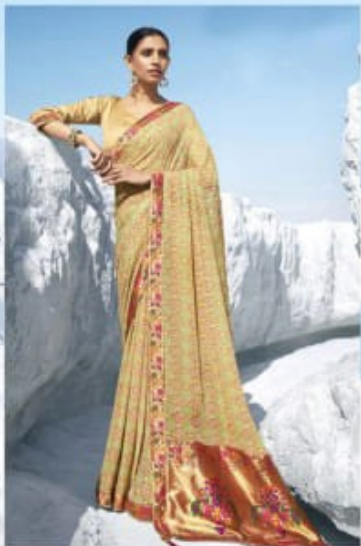
— 26495 —