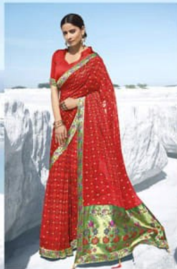
— 26496 —