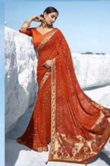
— 26494 —