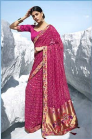
— 26491 —