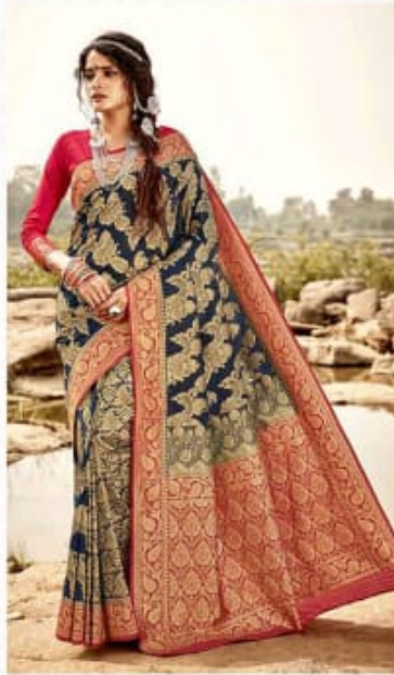
SAUBHAAGYA DAYINI / A