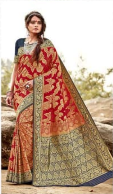
SAUBHAAGYA DAYINI / C