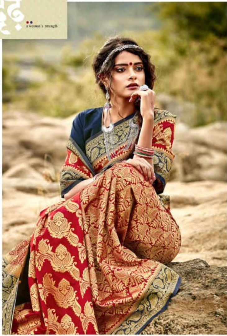
Gathering the essence of Indian tradition and blending it carefully with flowing modernity, evolving phenomenal designs and free expressions.