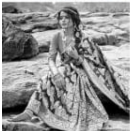
She is beautiful in her own ways she is full of hope and dreams!