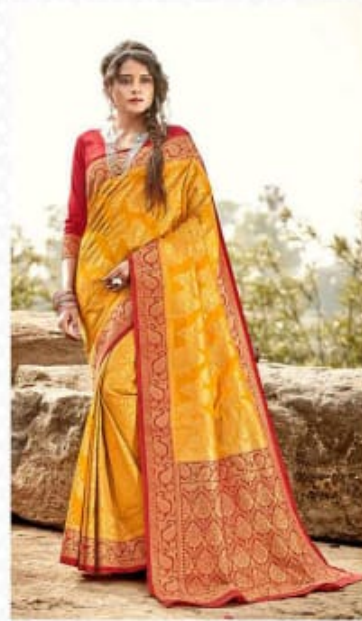
SAUBHAAGYA DAYINI / D