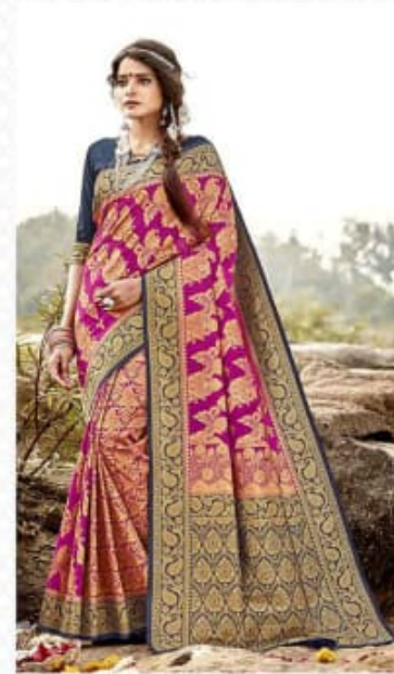
SAUBHAAGYA DAYINI / E