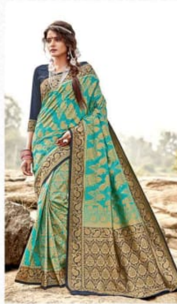
SAUBHAAGYA DAYINI / B