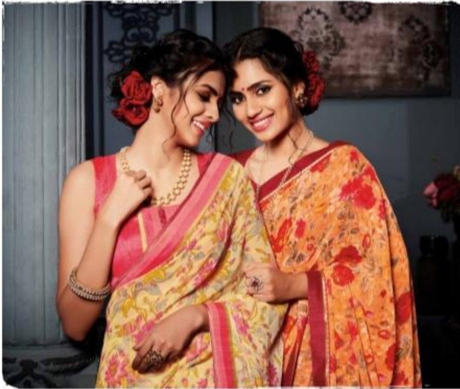
THEY LOOK, THEY TALK, THEY FOLLOW. THE BEST COLLECTION OF SAREES IS HERE