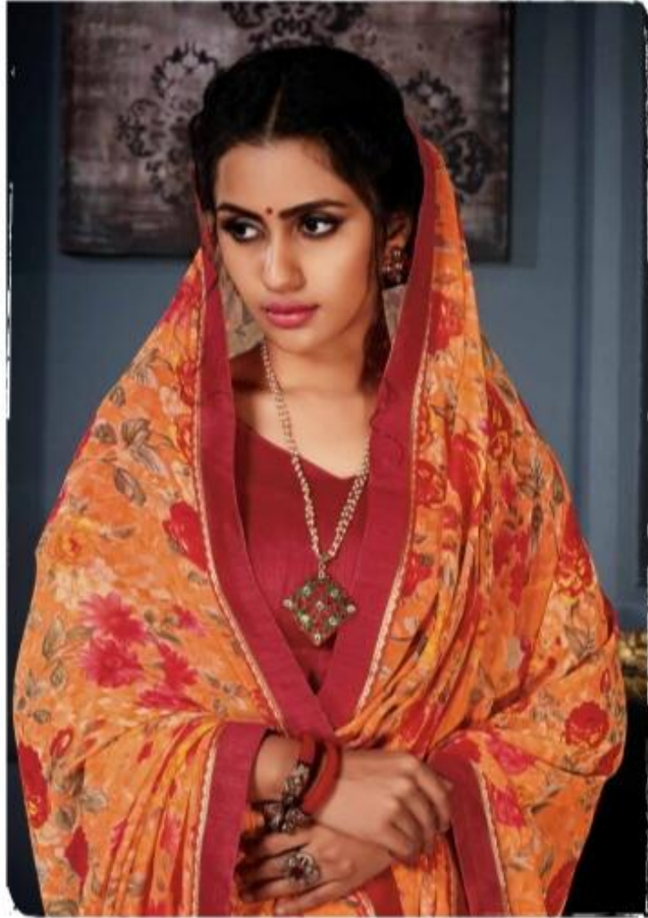
Discover handcrafted tradition Couture inspired by heritage crafts.