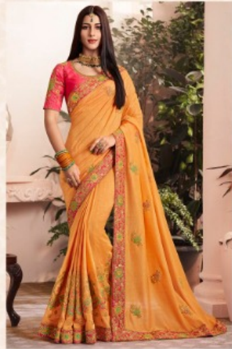
◆ 9004 ◆