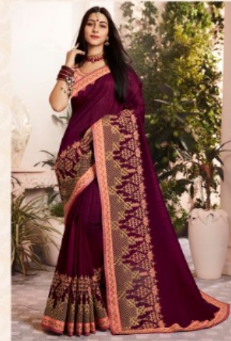
◆ 9008 ◆