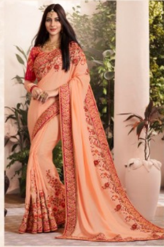
◆ 9002 ◆