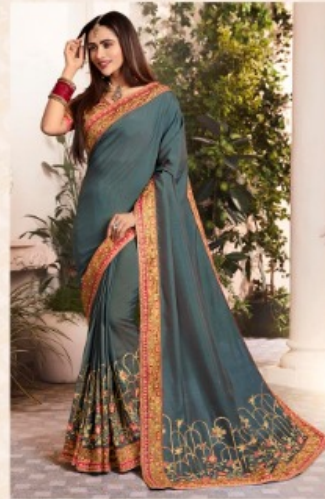
◆ 9007 ◆