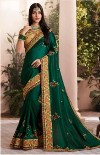
◆ 9001 ◆