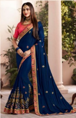
◆ 9003 ◆