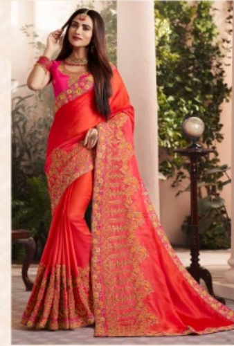
◆ 9006 ◆