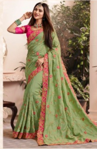
◆ 9005 ◆