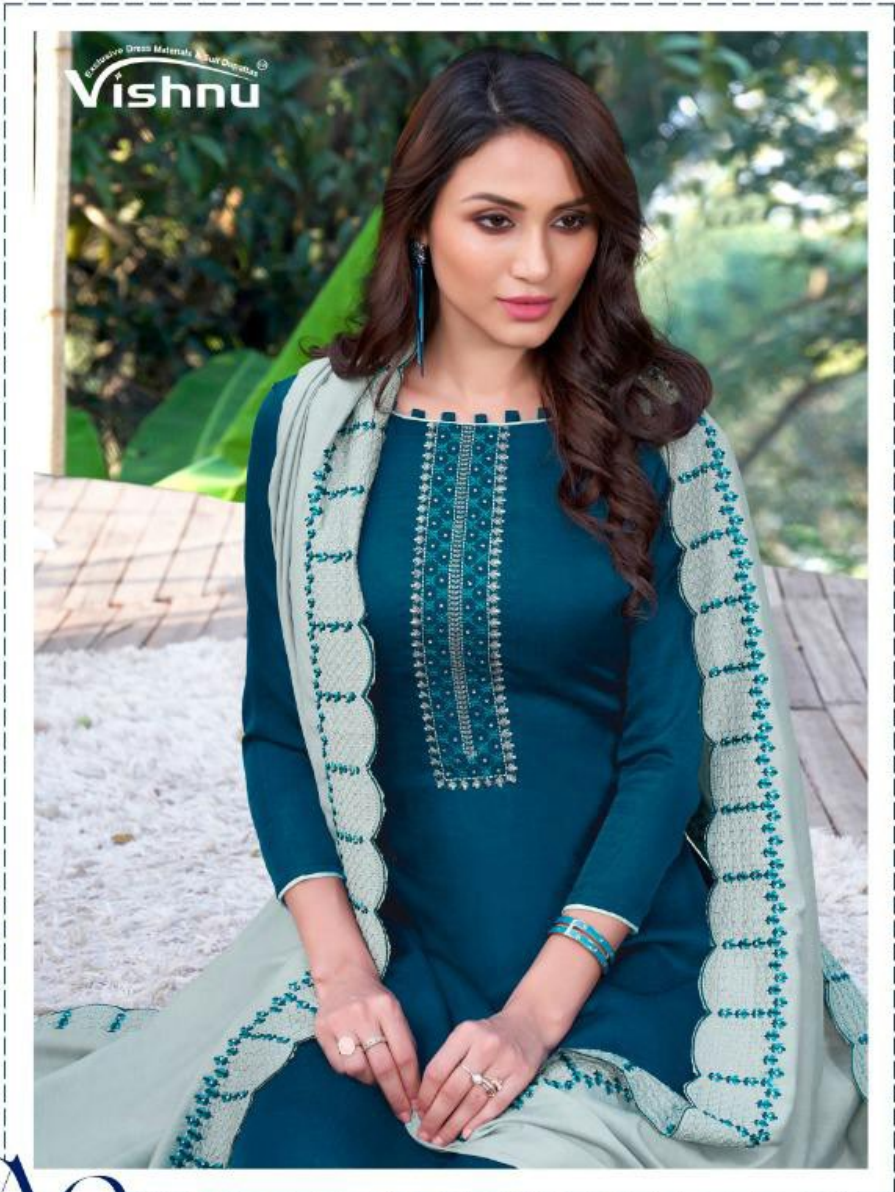
Feel the enchanting radiance of season with dress. Blue embroidery ings in a complete look of elegance and simplicity...