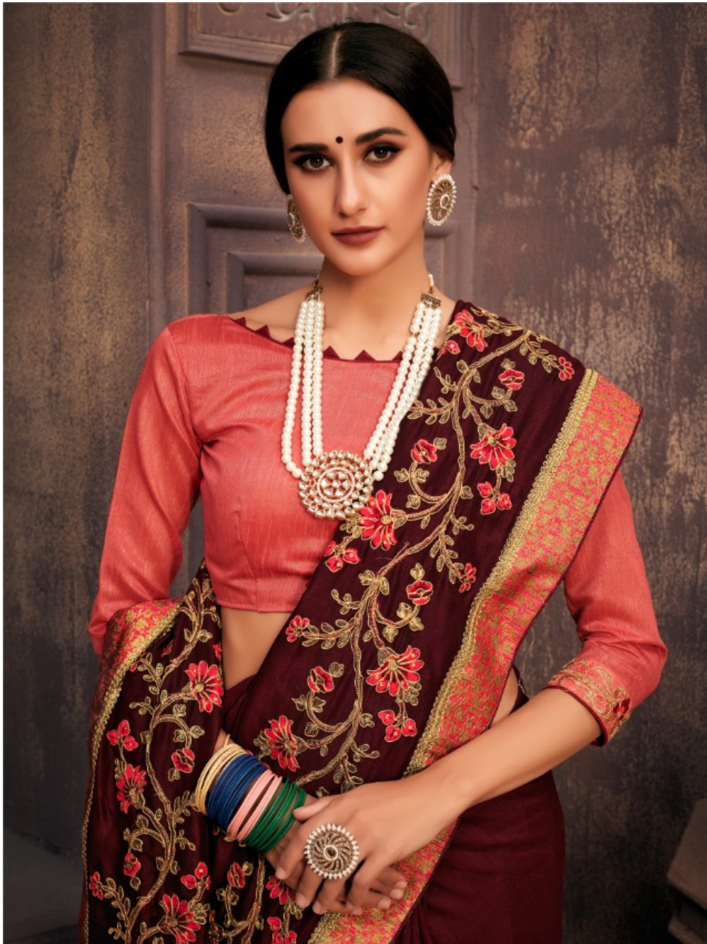
Hot petals the season's new designs bloom with sumptuous florals in floppy chiffons.