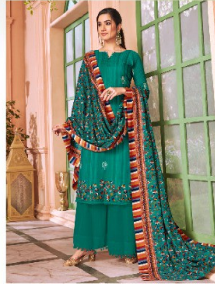
d.no : 2005