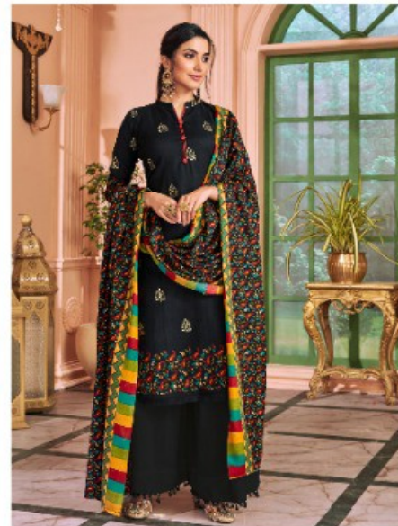
d.no : 2007