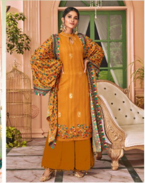
d.no : 2006