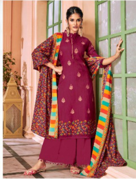
d.no : 2002