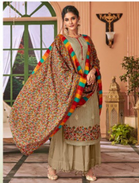
d.no : 2004