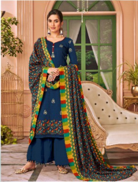
d.no : 2001