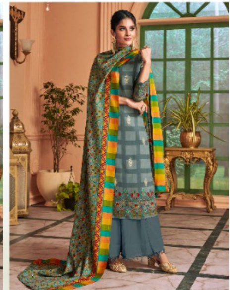
d.no : 2008