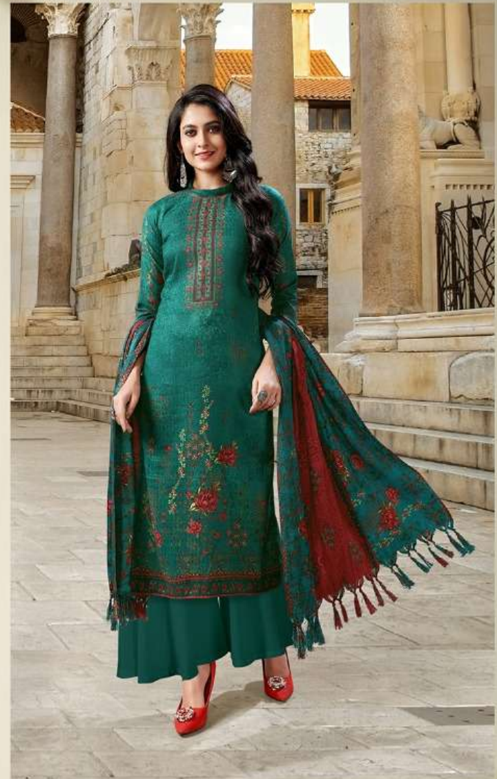
IN THE 21ST CENTURY THE STYLE TRENDS OF THE FASHION INDUSTRY DOMINATE THE WORLD MORE THAN THEY EVER DID, AND CONTROL NOT ONLY THE WAY PEOPLE DRESS BUT ALSO TRENDS IN HOME WARE DESIGN, MAKEUP FASHION AND PEOPLE'S OVERALL ATTITUDES. IN THE 90S FLOWER POWER DID NOT ONLY MEAN FLAIRS AND TUNICS, IT SUMMED UP THE WHOLE ATTITUDE OF A GENERATION, AND THIS IS EVEN MORE PROMINENT TODAY. D.NO. 1003