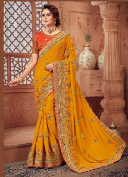
d.no : 1307