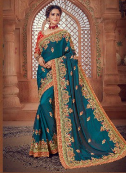
d.no : 1302