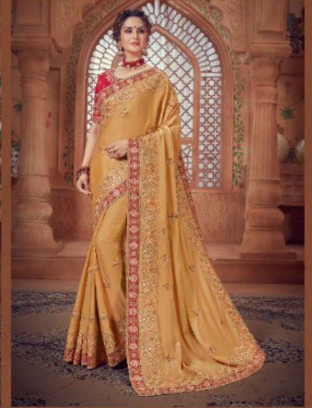
d.no : 1304