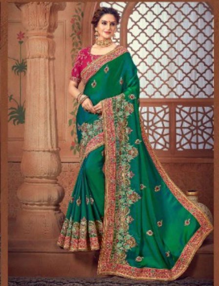
d.no : 1308