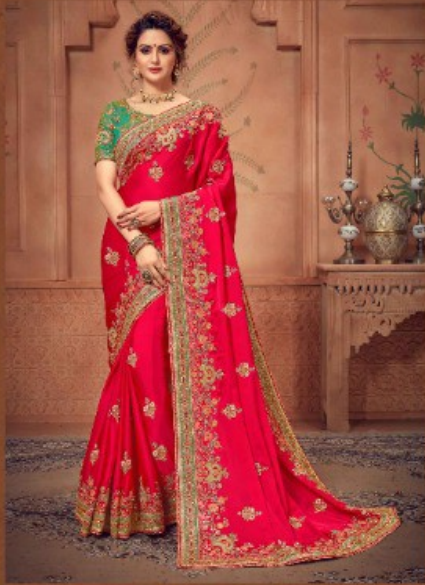
d.no : 1301