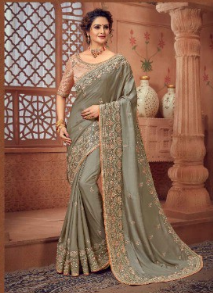
d.no : 1306