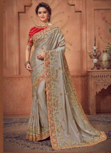
d.no : 1303