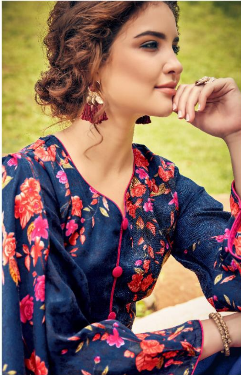
If woman's dress should be a like a good-wire fence, serving its purpose without obstructing the view