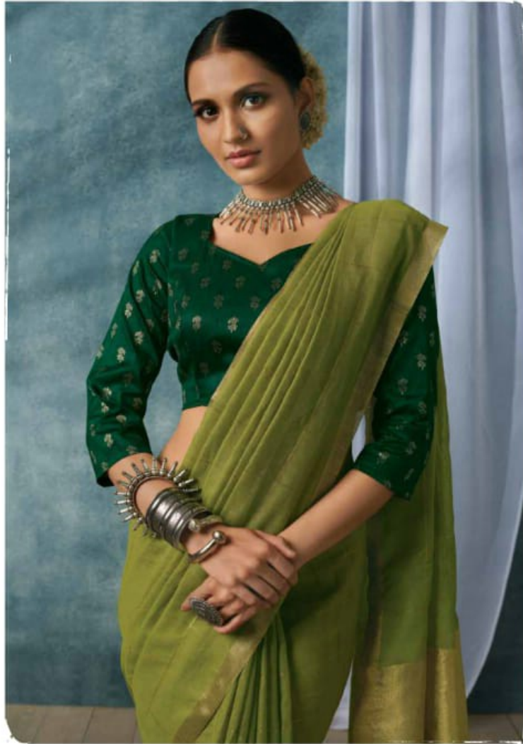
A touch of sophistication with exquisite designs for ethnic and indo-western wear.