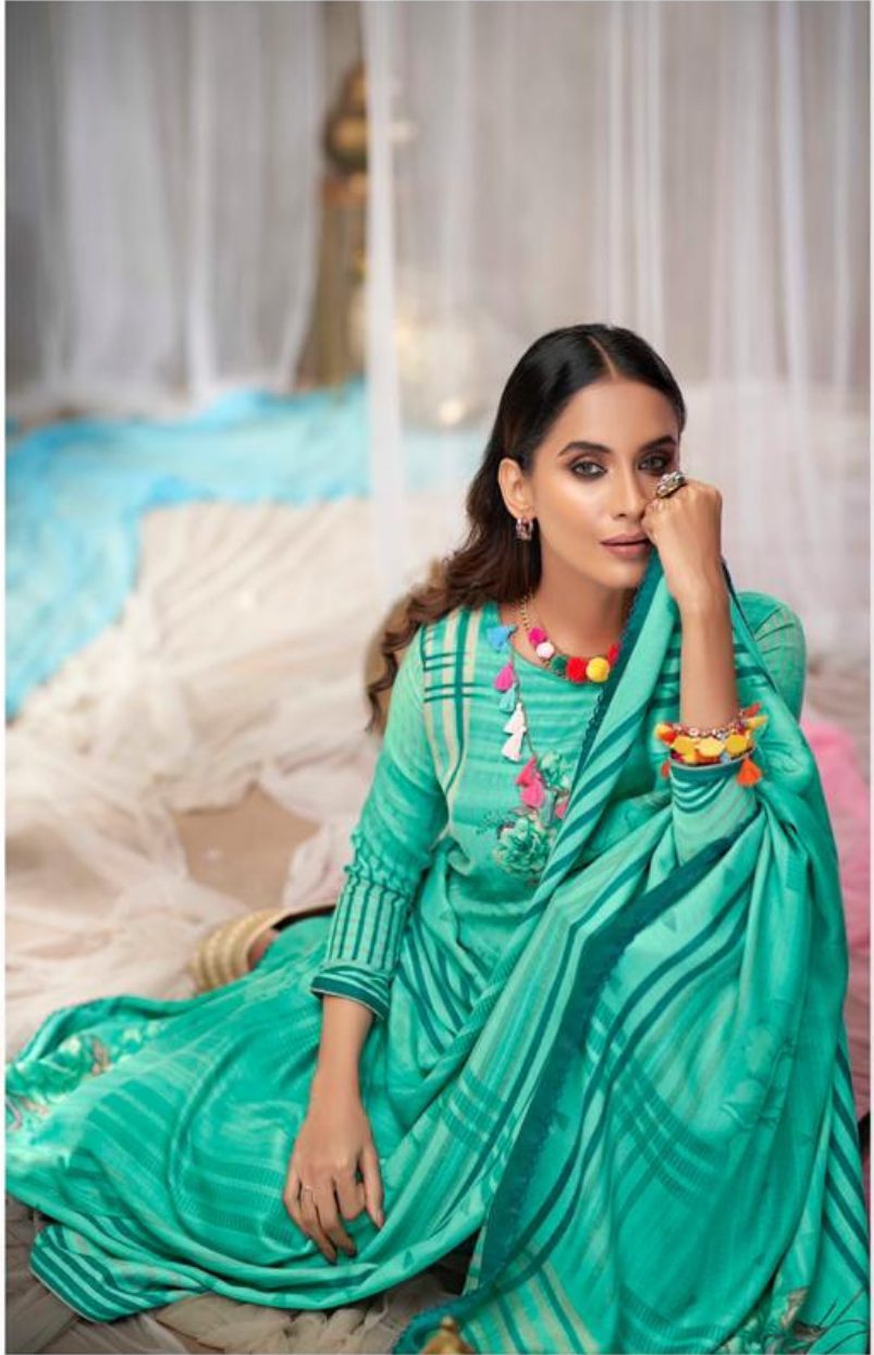
D.no : 1007