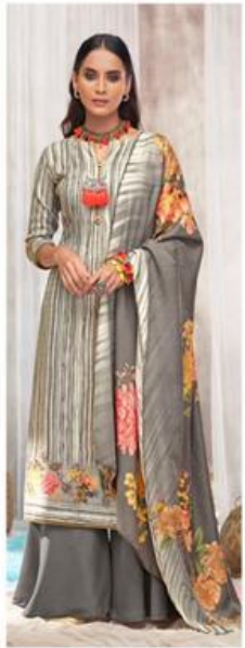
D.no : 1001