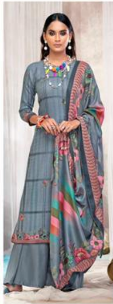
D.no : 1008