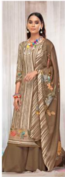
D.no : 1004