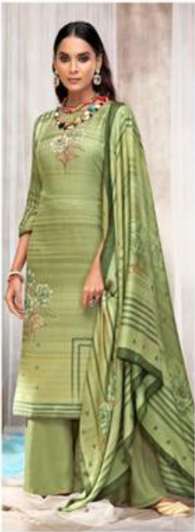
D.no : 1006