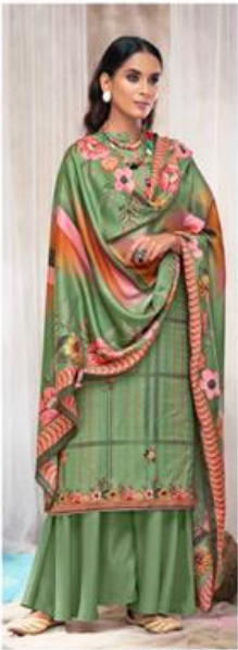
D.no : 1002