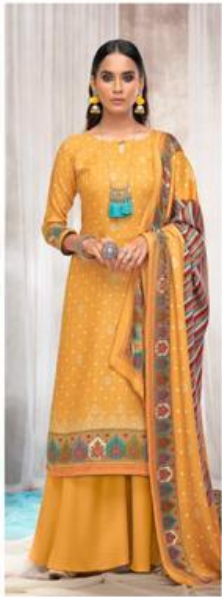
D.no : 1003