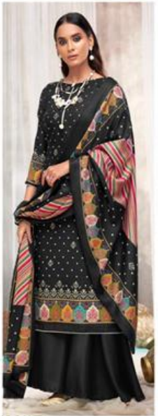
D.no : 1005