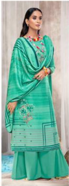
D.no : 1007