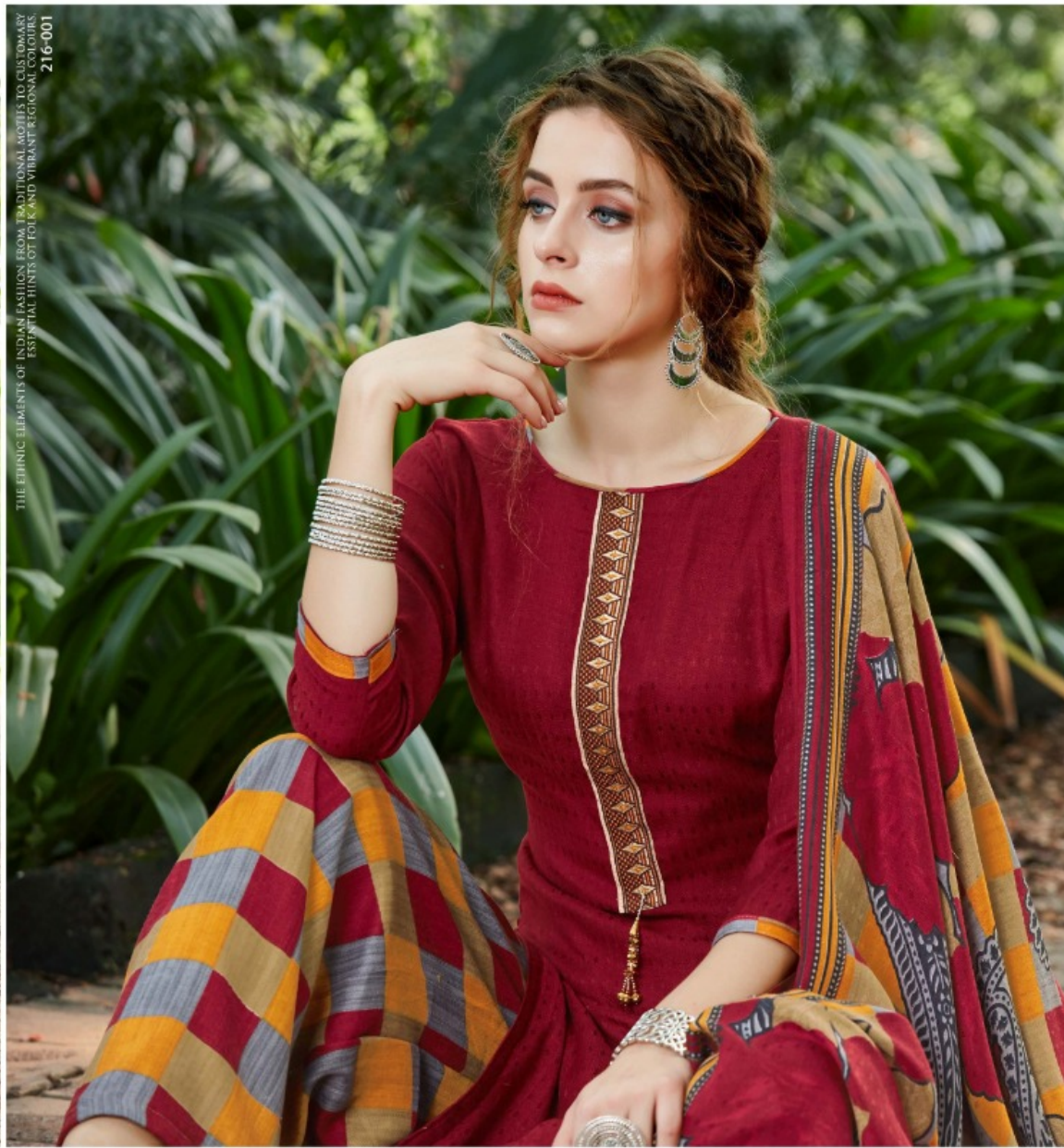
THE ETHNIC ELEMENTS OF INDIAN FASHION FROM TRADITIONAL MOTIFS TO CONTEMPORARY ESSENTIAL HINTS OF FOLK AND VIBRANT REGIONS Z16-001