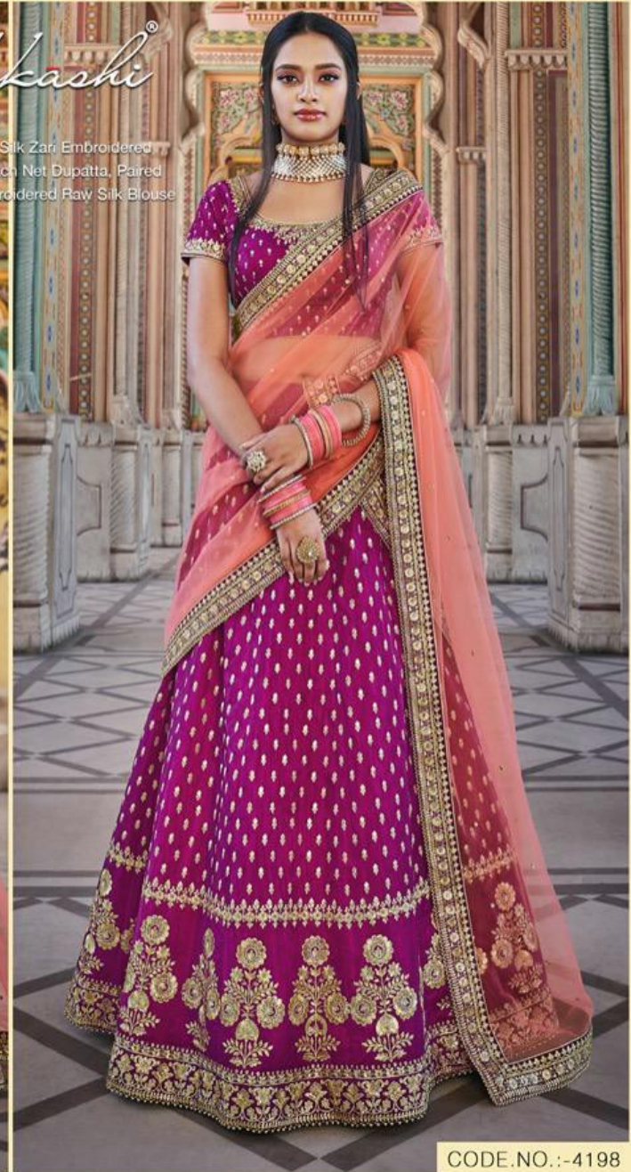
nakkashi Wine Handloom Silk Zari Embroidered Lehenga With Peach Net Dupatta, Paired With Wine Zari Embroidered Raw Silk Blouse