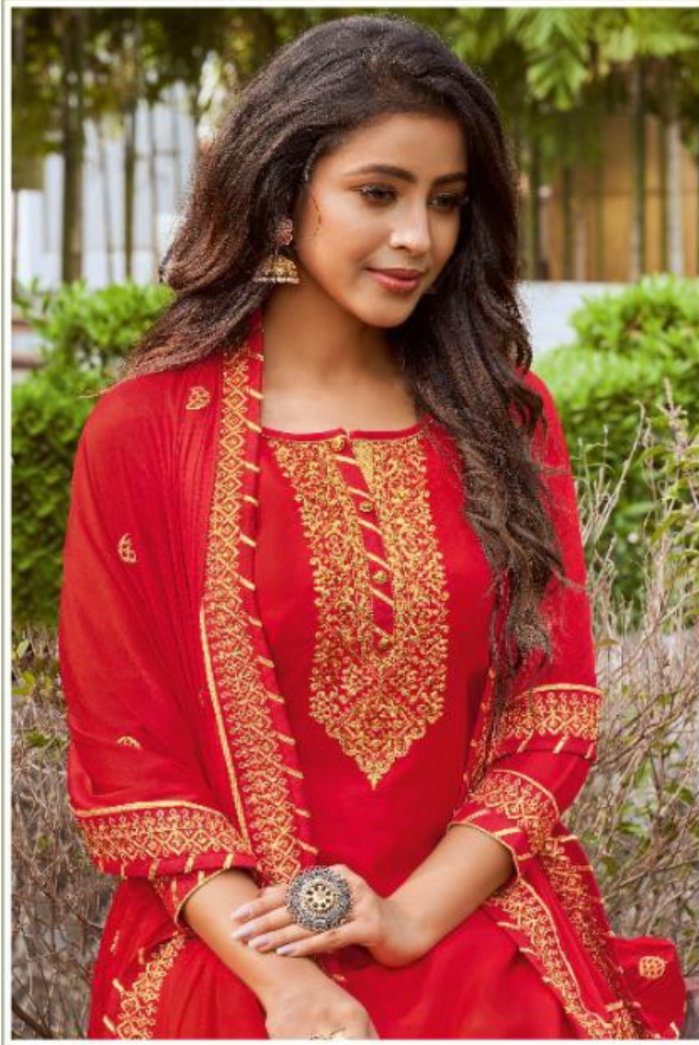
a blend of colors that highlight every corner of the attractive designs that in turn adorn you with vast beauty 3 2 1