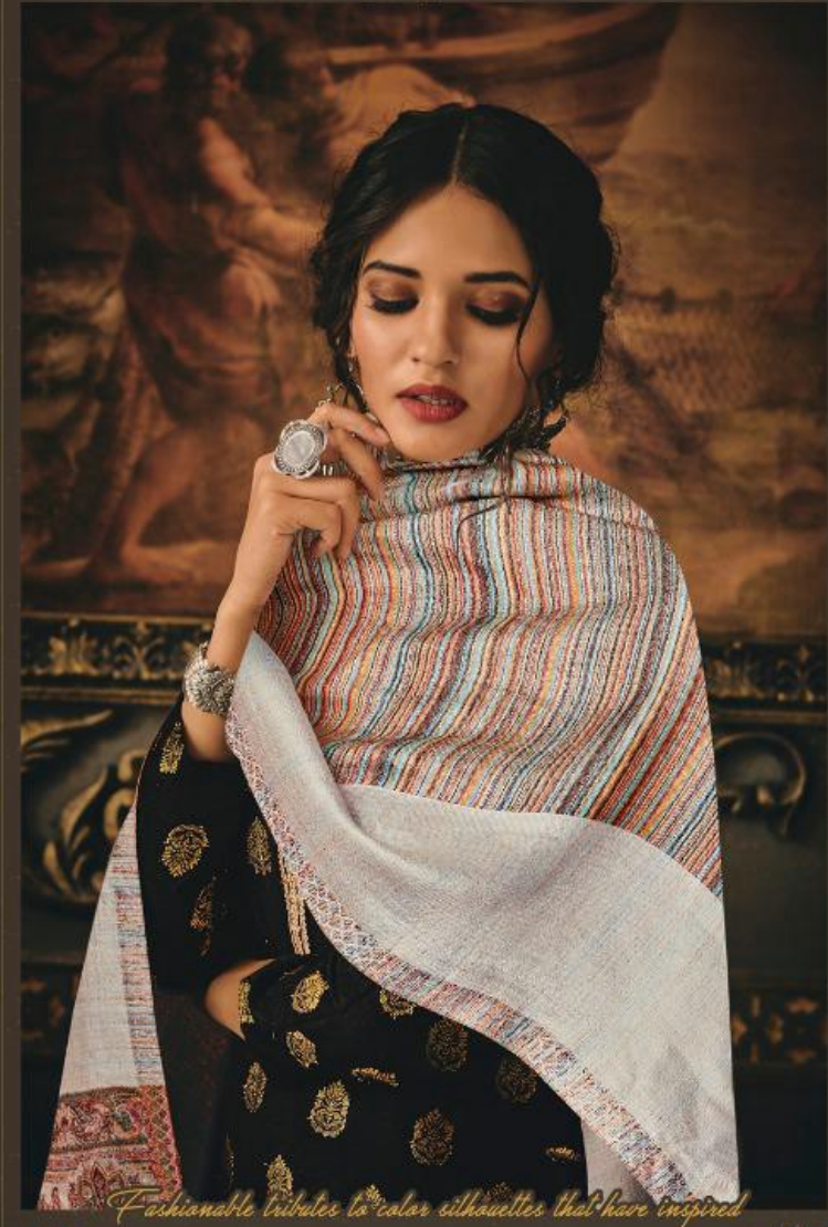
Fashionable tributes to color silhouettes that have inspired