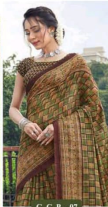
G. C. P. - 07