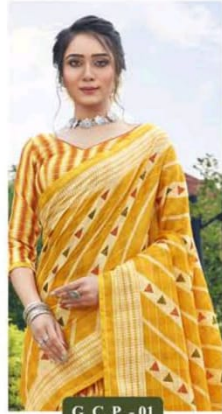
G. C. P. - 01