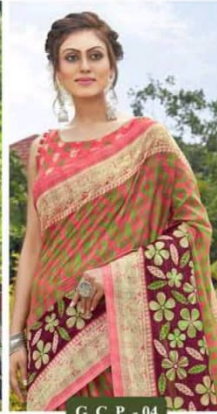
G. C. P. - 04