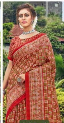
G. C. P. - 12