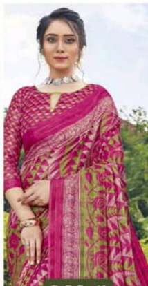
G. C. P. - 10