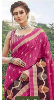
G. C. P. - 05