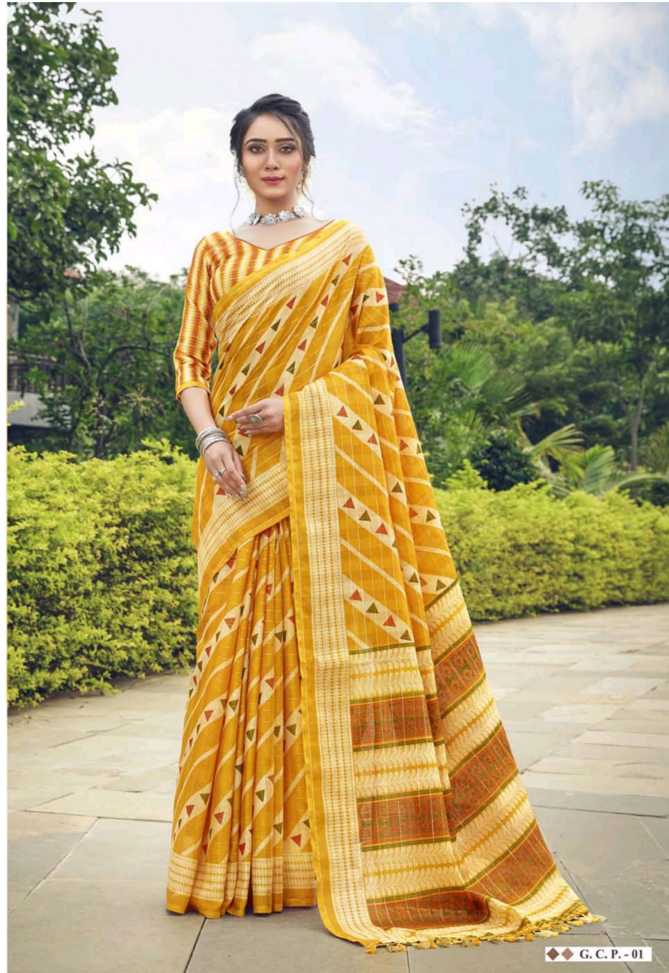
◆◆ G. C. P. - 01