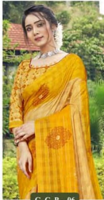
G. C. P. - 06