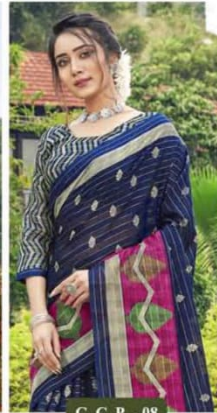
G. C. P. - 08