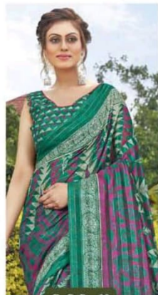
G. C. P. - 09