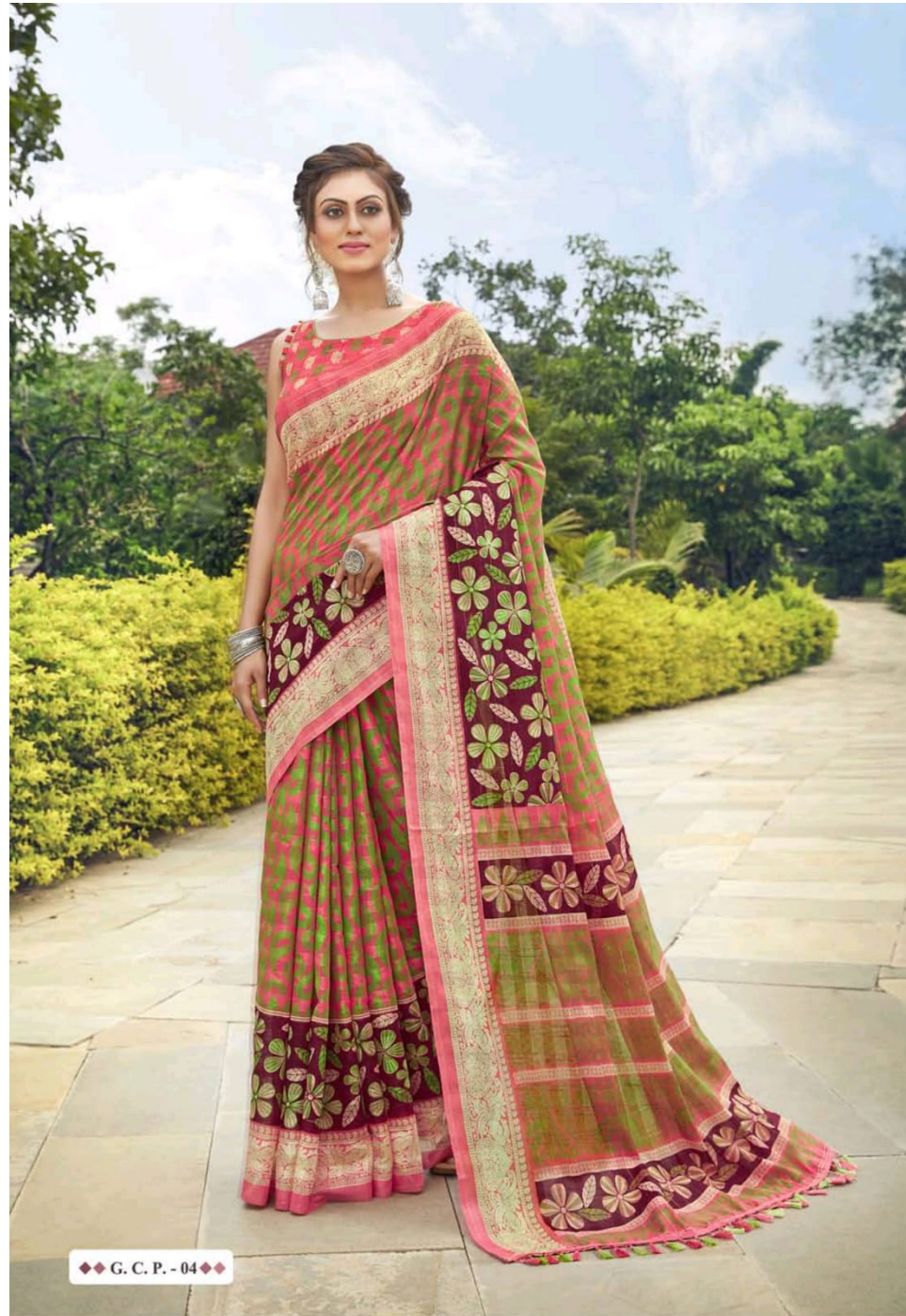
◆◆ G. C. P. - 04 ◆◆