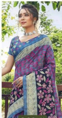
G. C. P. - 11