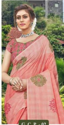
G. C. P. - 02