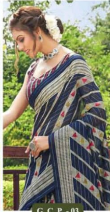
G. C. P. - 03