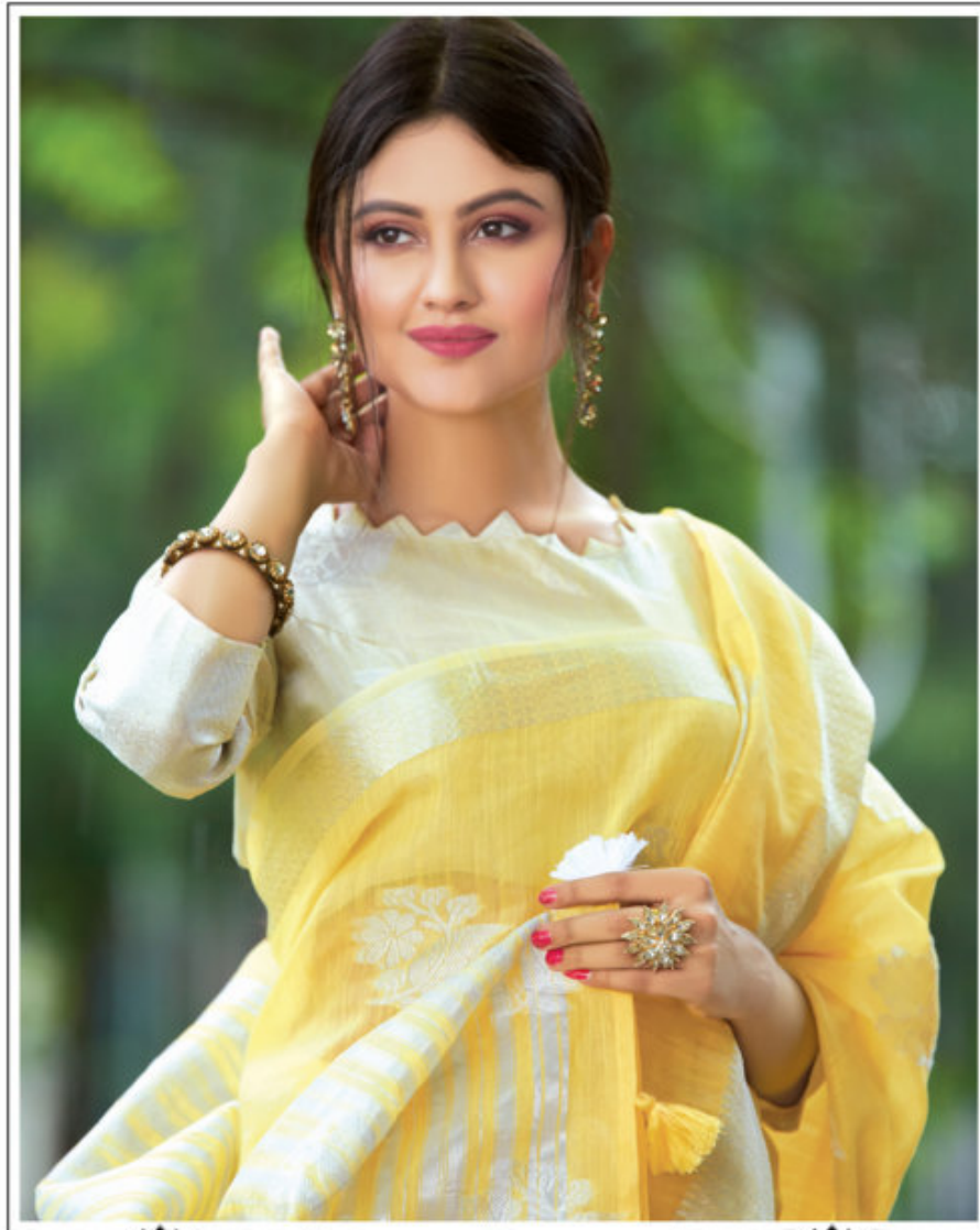
Authentic Embroideries in pastels