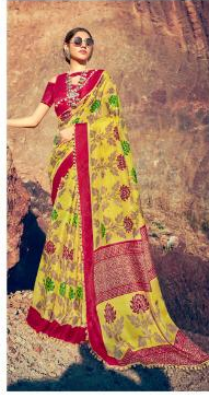
W T -02