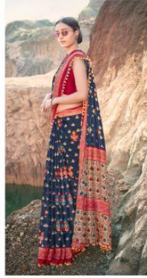
W T -03