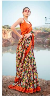
W T -08