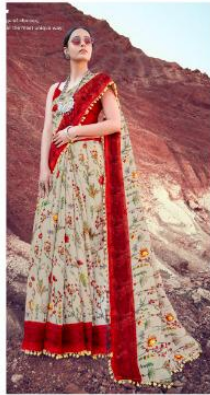
W T -05