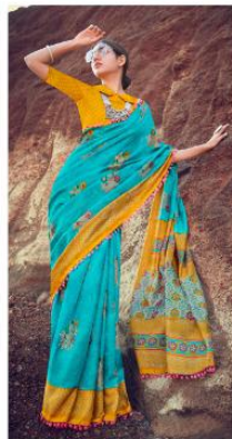
W T -11