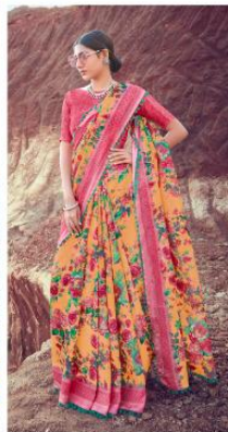
W T -10