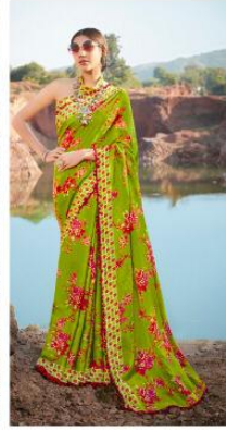
W T -04