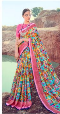
W T -06