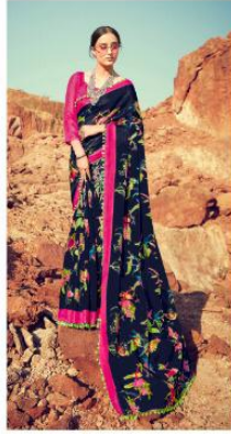
W T -01