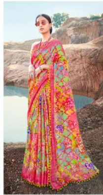
W T -07