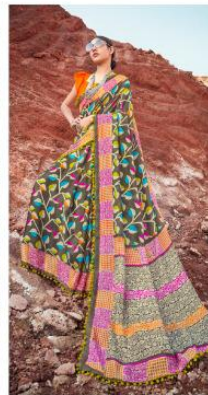
W T -12