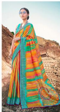
W T -09