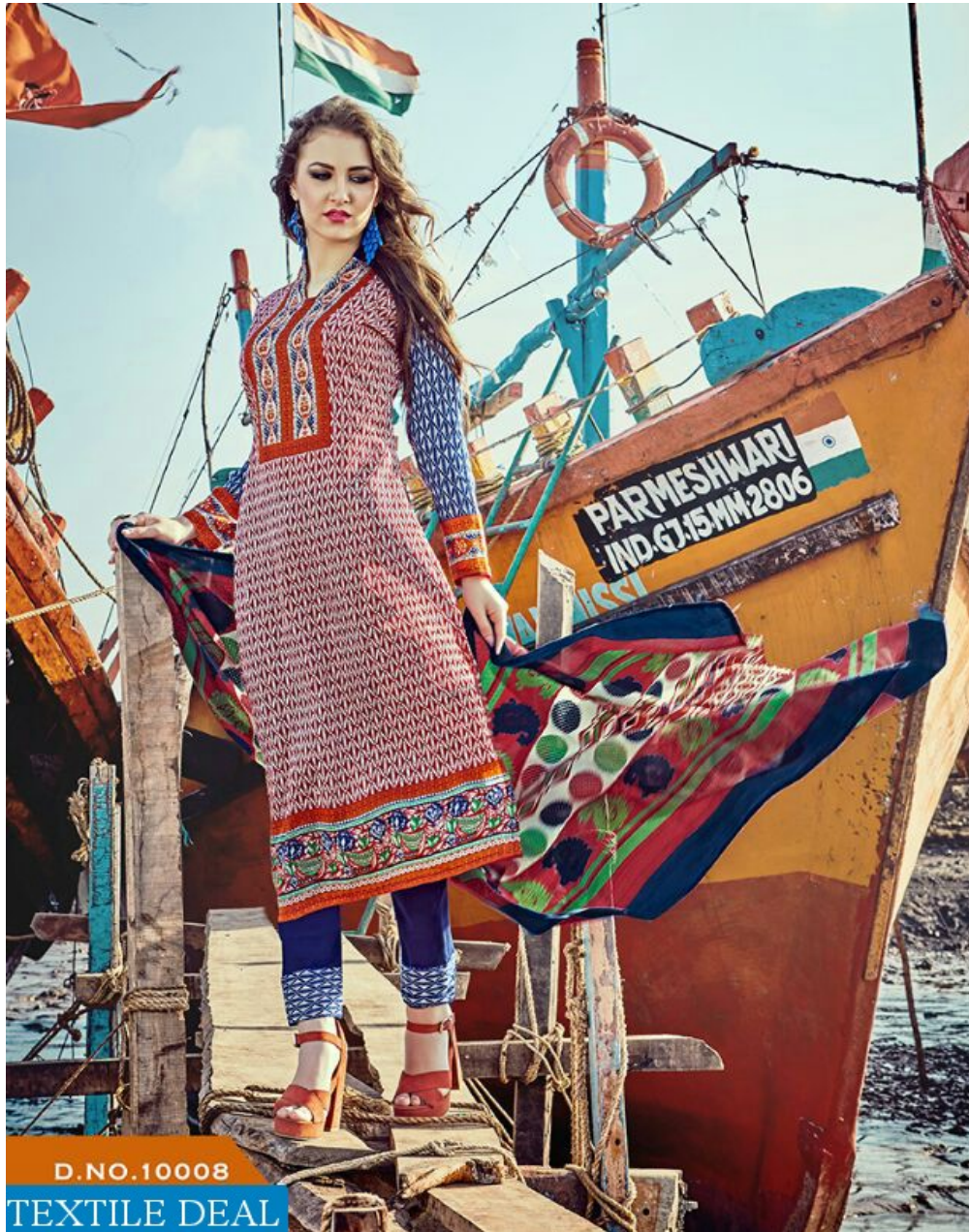
D.NO.10008 TEXTILE DEAL