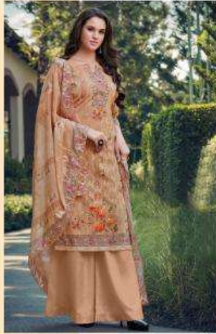
Style No. 401