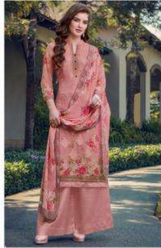
Style No. 402