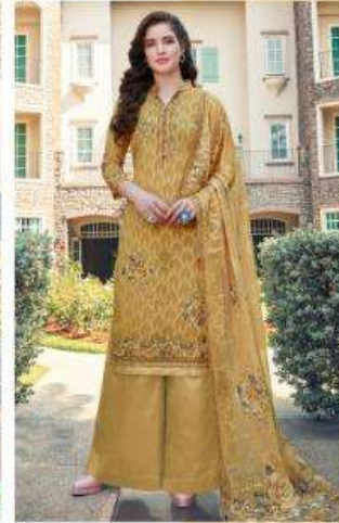
Style No. 406