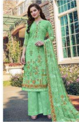
Style No. 405