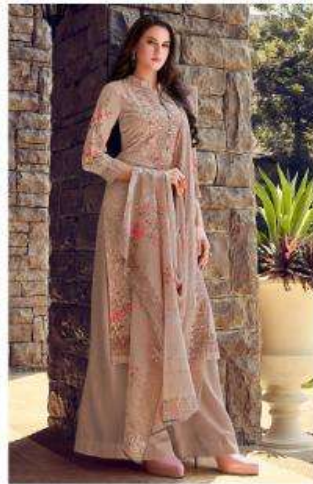
Style No. 404