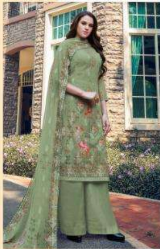
Style No. 403