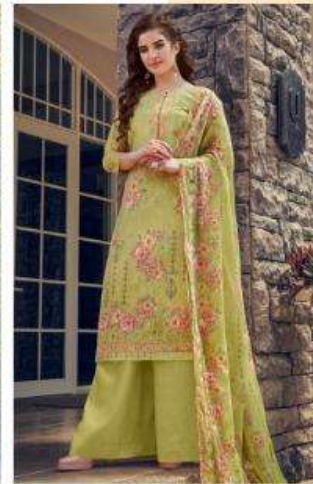
Style No. 408