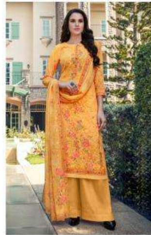
Style No. 407