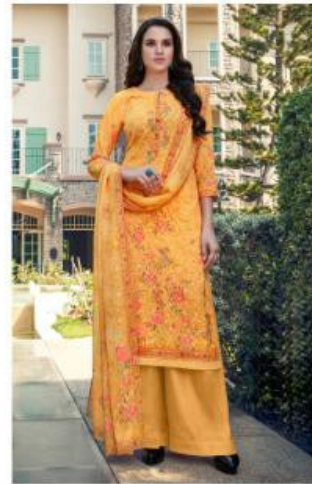
Style No. 407 ||