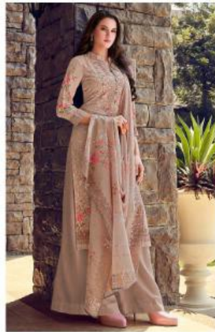
Style No. 404 ||