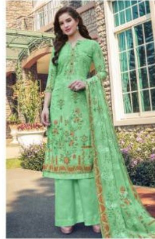
Style No. 405 ||