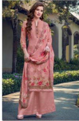
Style No. 402 ||