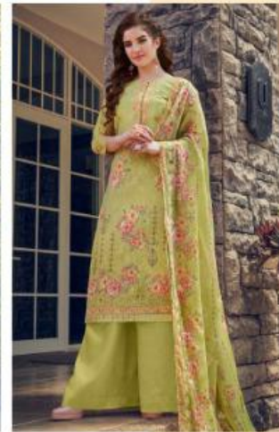
Style No. 408 ||