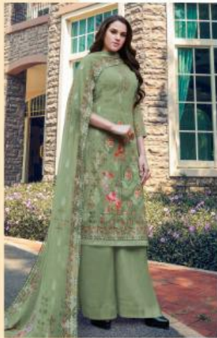
Style No. 403 ||