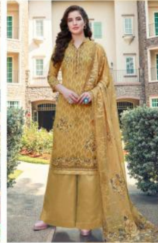
Style No. 406 ||