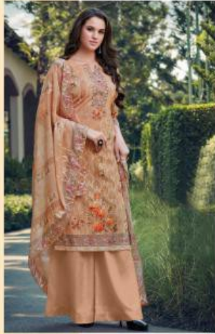
Style No. 401 ||