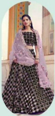
DESIGN : NO - 5801