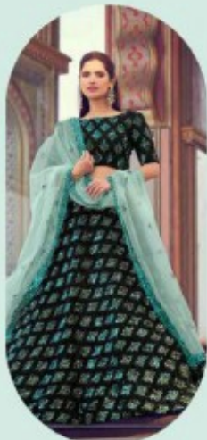
DESIGN : NO - 5803