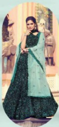
DESIGN : NO - 5807