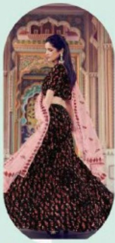
DESIGN : NO - 5805