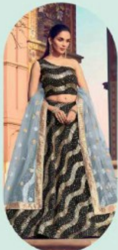
DESIGN : NO - 5802