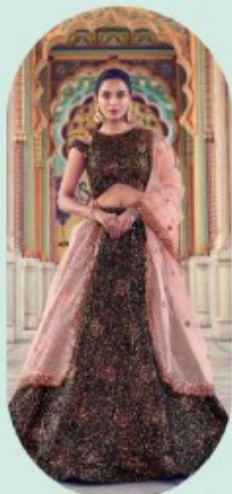
DESIGN : NO - 5806