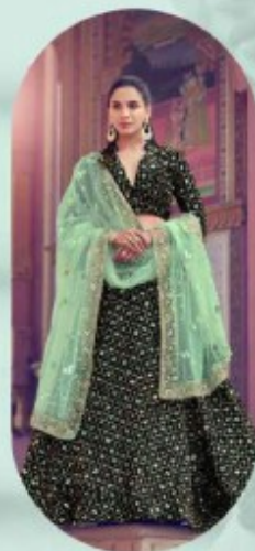
DESIGN : NO - 5808