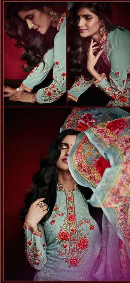
Outfit - 3901