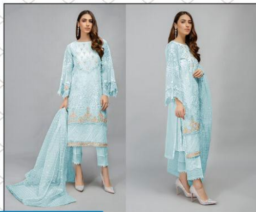
TEXTILE DEAL C-1050 C