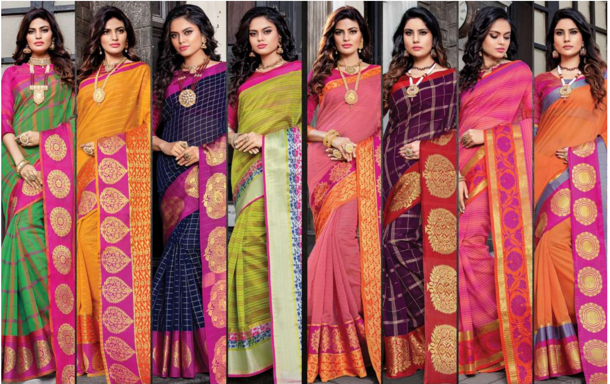
D.no - 1001