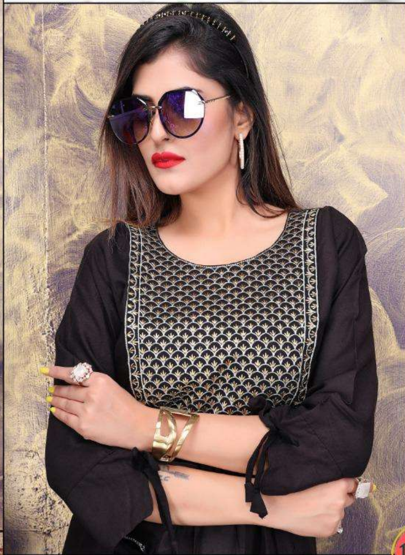
apsulates the beauty of the indian woman gracefully draped in effulgent dress. e collection reflects the immaculate soul of the woman, through alluring work