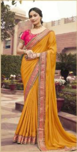
+ 1803 +