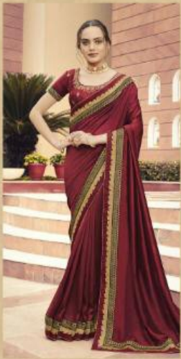
+ 1804 +