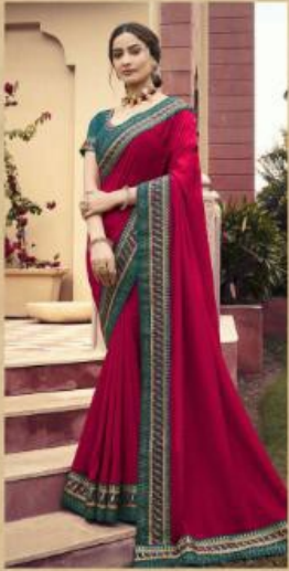
+ 1801 +