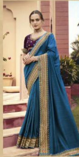
+ 1808 +