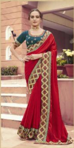
+ 1806 +