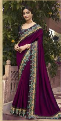
+ 1807 +