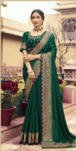
+ 1805 +