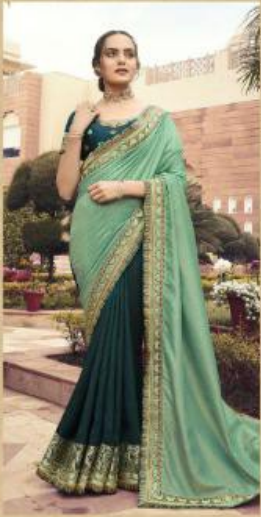
+ 1802 +