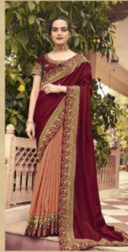
+ 1809 +