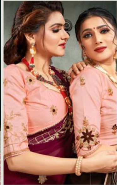
ethnic elements of Indian fashion from traditional motifs to customary regional colours, contemporary stance and hundred person