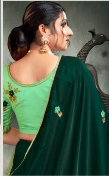
ethnic elements of indian fashion from traditional motifs to customary regional colours, contemporary stance and hundred person