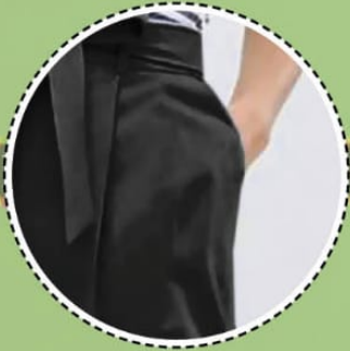
Both Side Pocket