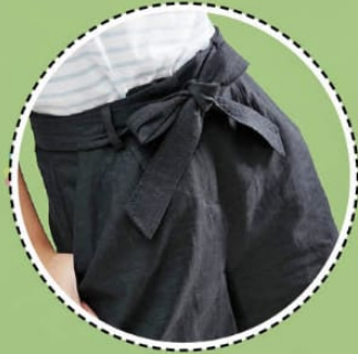
Full Length Belt for Perfect Knot