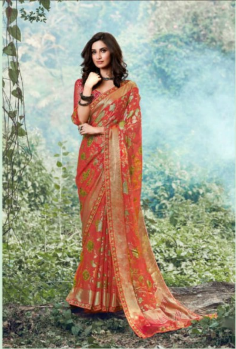
TEXTILE DEAL ◆◆ DESIGN - 91007 ◆◆