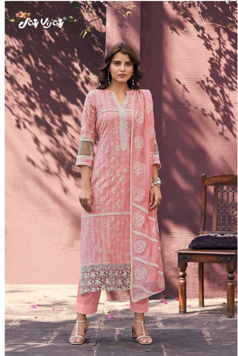
5887 ~ Flowers are the pattern of spring summer 2021 ~