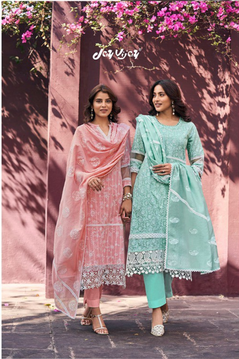
Lace fabrics, bold patterns & sumptuous detailing adorn modern silhouettes