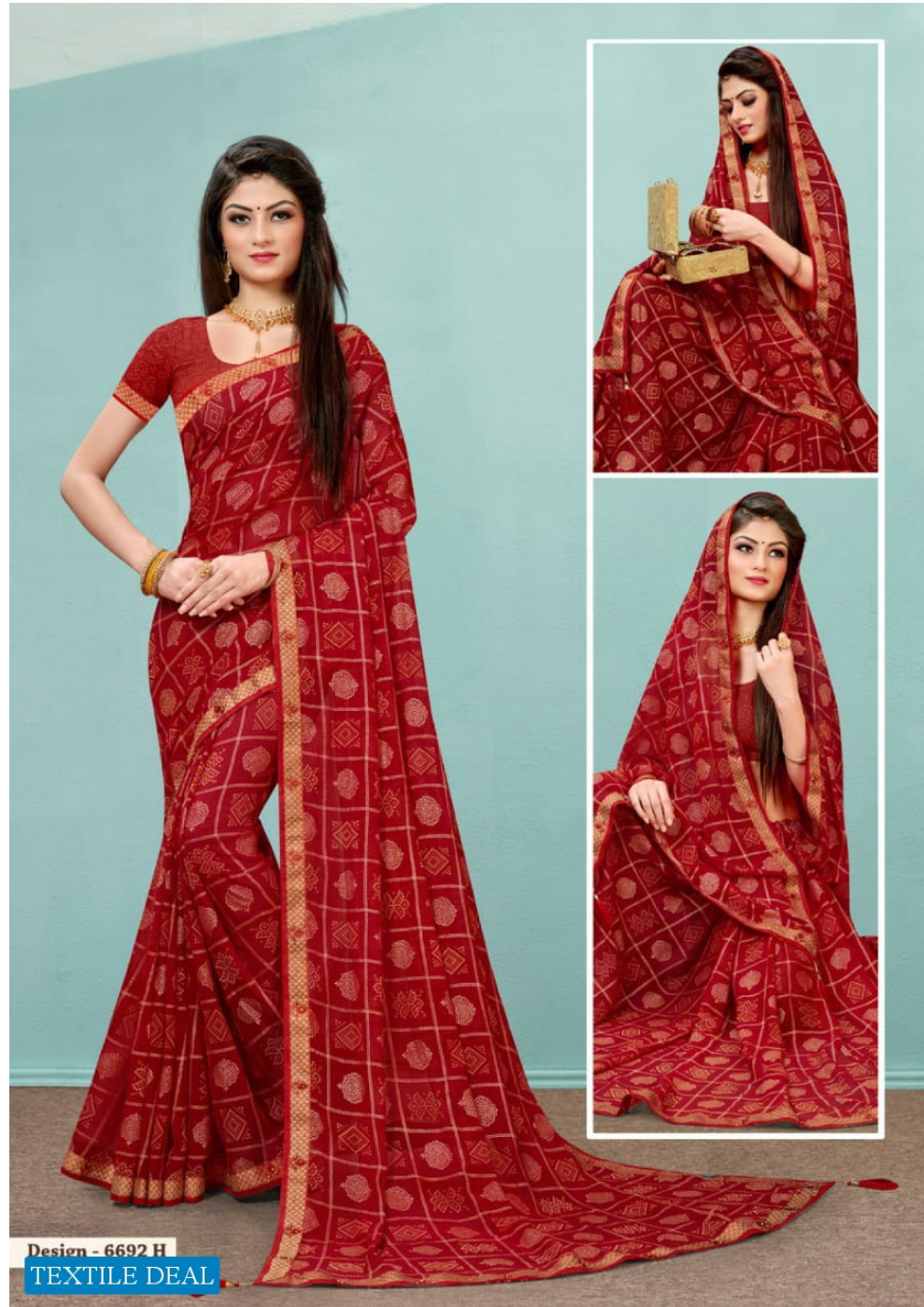
Design - 6692 H TEXTILE DEAL