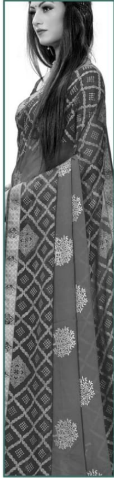
Design - 6692 D