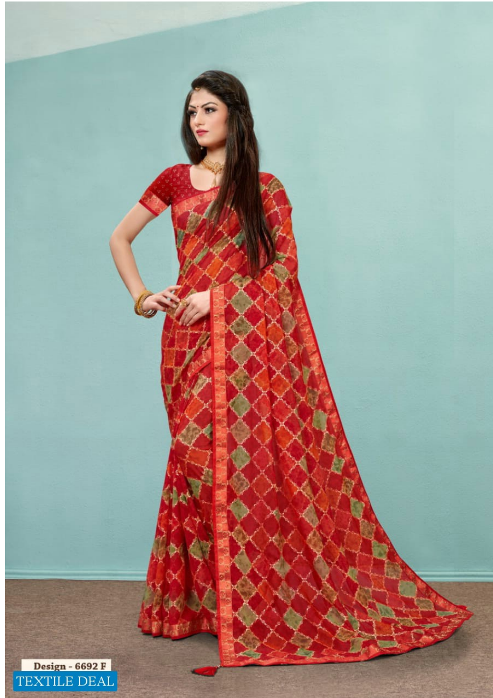
Design - 6692 F TEXTILE DEAL