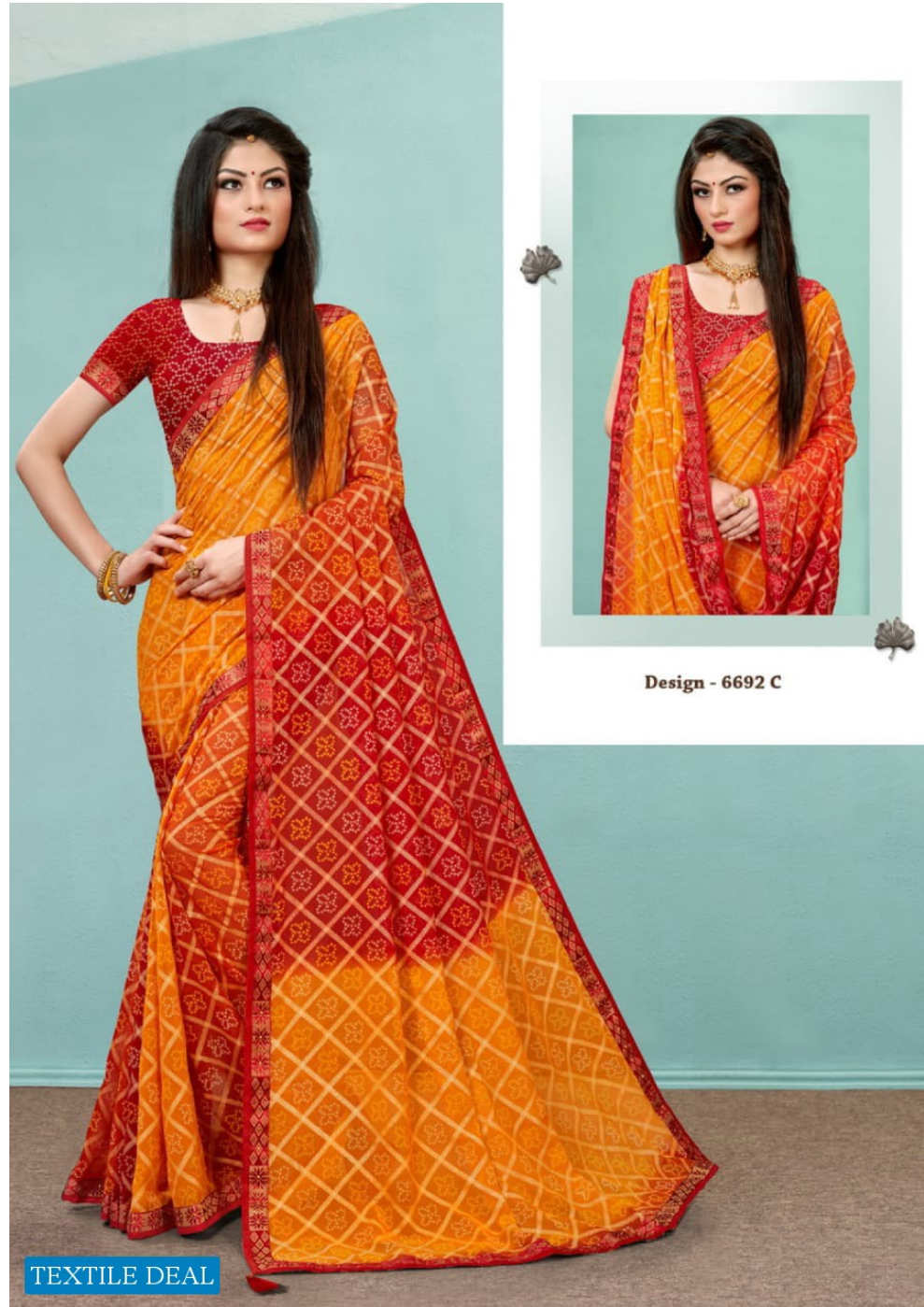
Design - 6692 C