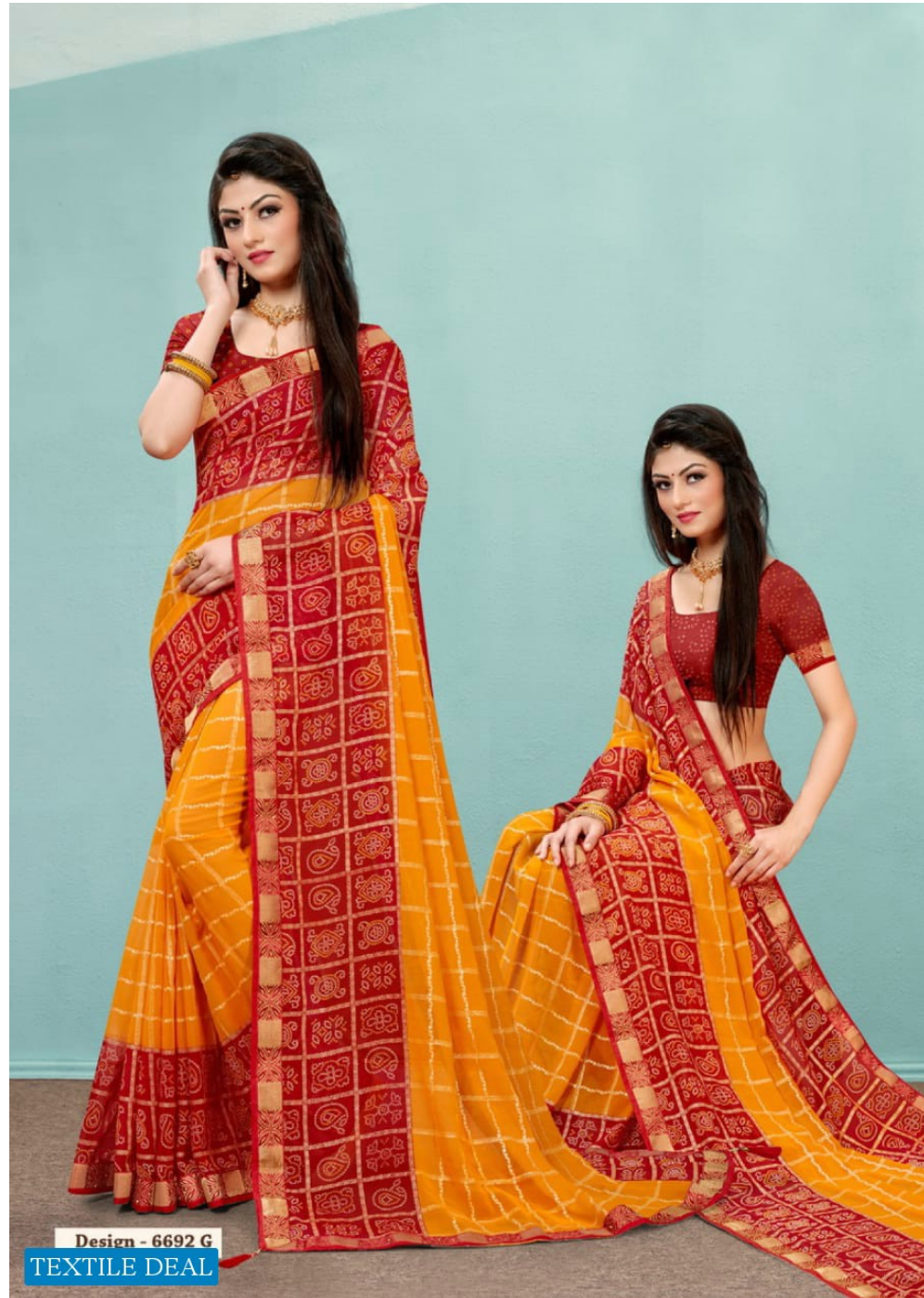
Design - 6692 G TEXTILE DEAL