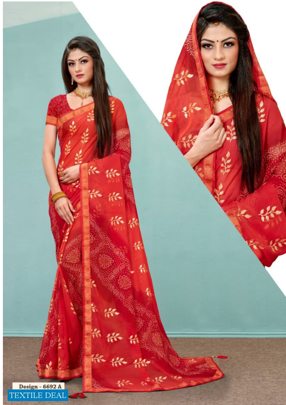
Design - 6692 A TEXTILE DEAL