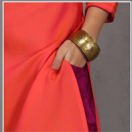
All Palazzo with Pocket