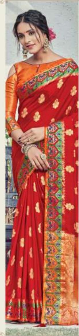
Style No 1006