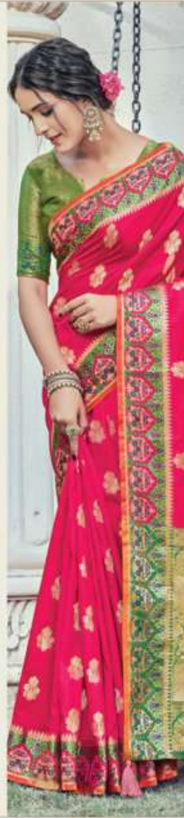
Style No 1004