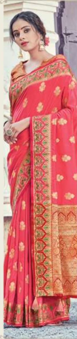
Style No 1003