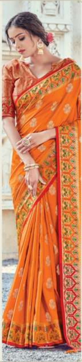
Style No 1001