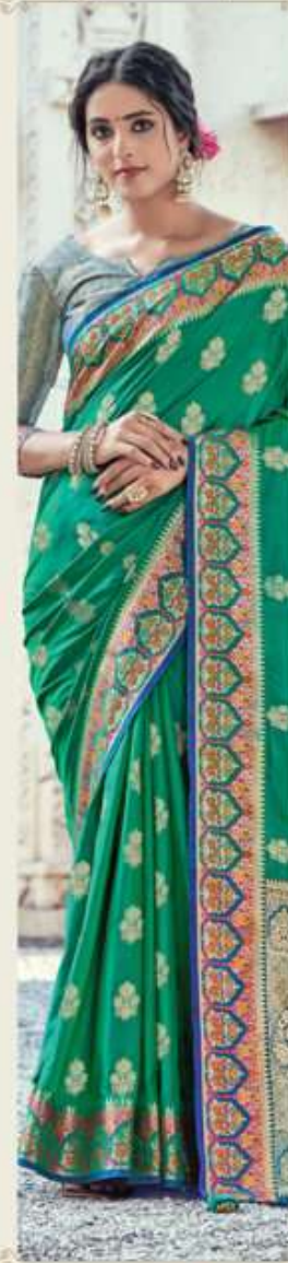
Style No 1005