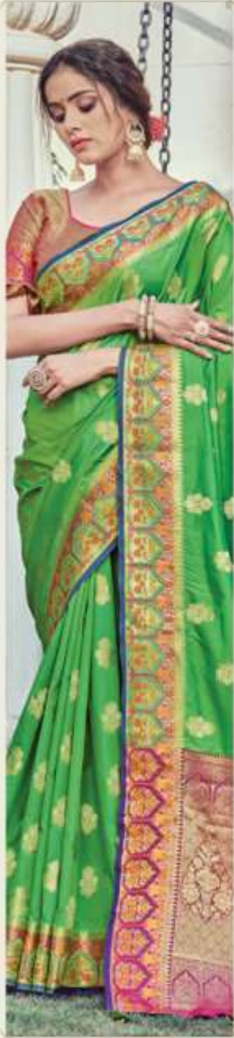
Style No 1002