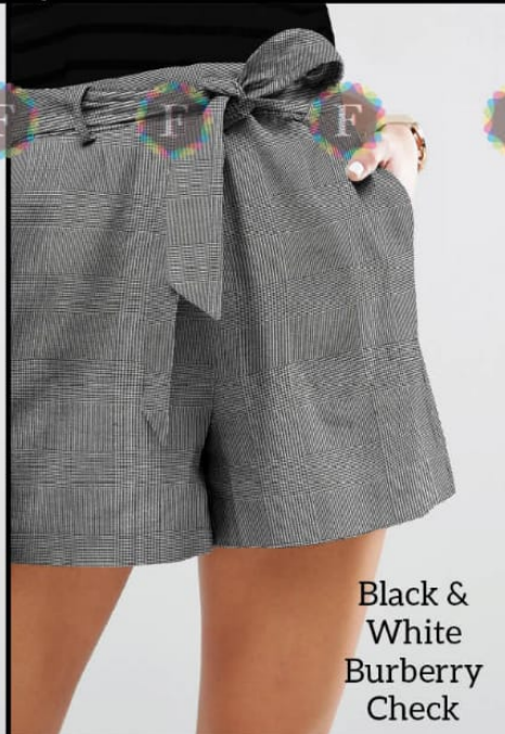
Black & White Burberry Check