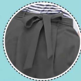
Full Length Belt for Perfect Knot