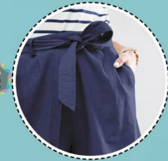
Both Side Pocket