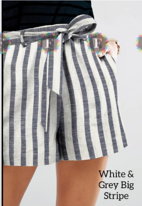
White & Grey Big Stripe