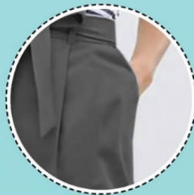
Both Side Pocket

LATEST FASHION • HI-QUALITY • LOWEST PRICE