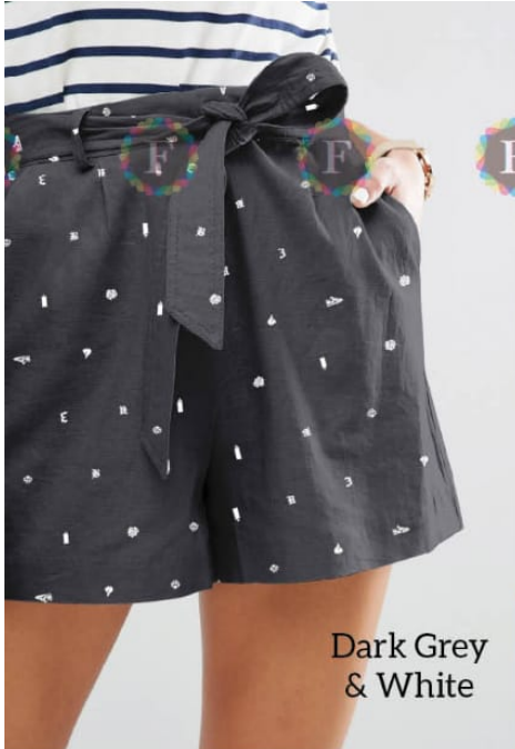
Dark Grey & White