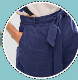
Full Length Belt for Perfect Knot