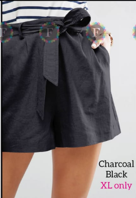
Charcoal Black XL only