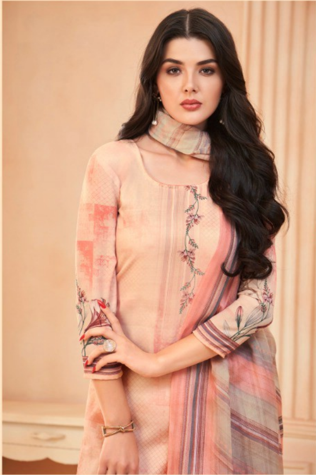
TOP : SWISS DIGITAL SATIN BOTTOM : CAMBRIC DYED DUPATTA : SWISS KOREAN PATTERN DUPATTA