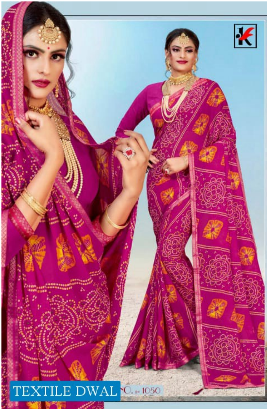
TEXTILE DWAL NO. :- 1050