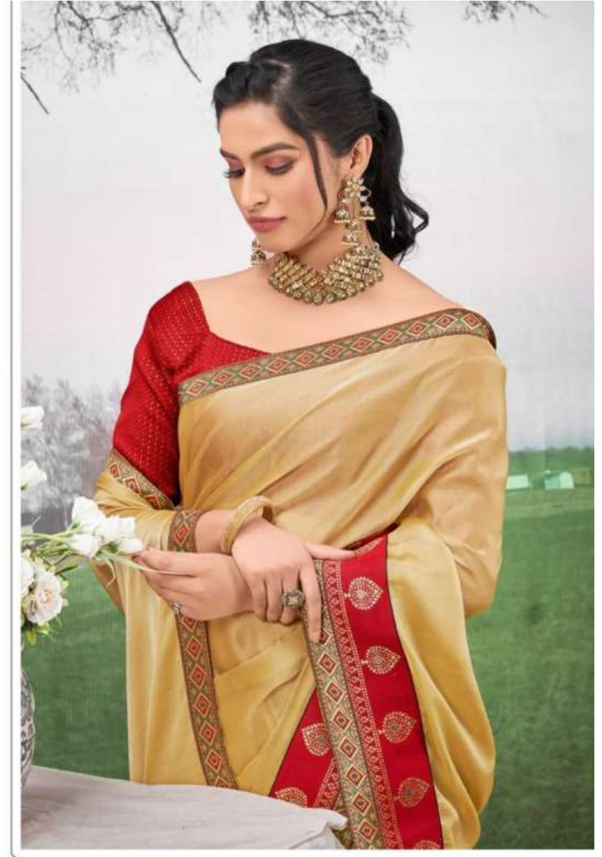
FLOWER CHILD THE CLASSIC PRINCE FLORE IS THE PRINCE OF THE PRINCE, BUT THE LIFE - CLASSIC CLOTHING IS THE PRINCE OF THE PRINCE, BUT THE PRINCE IS HOW HE GETS FROM IT, BEING THE PRINCE OF THE PRINCE