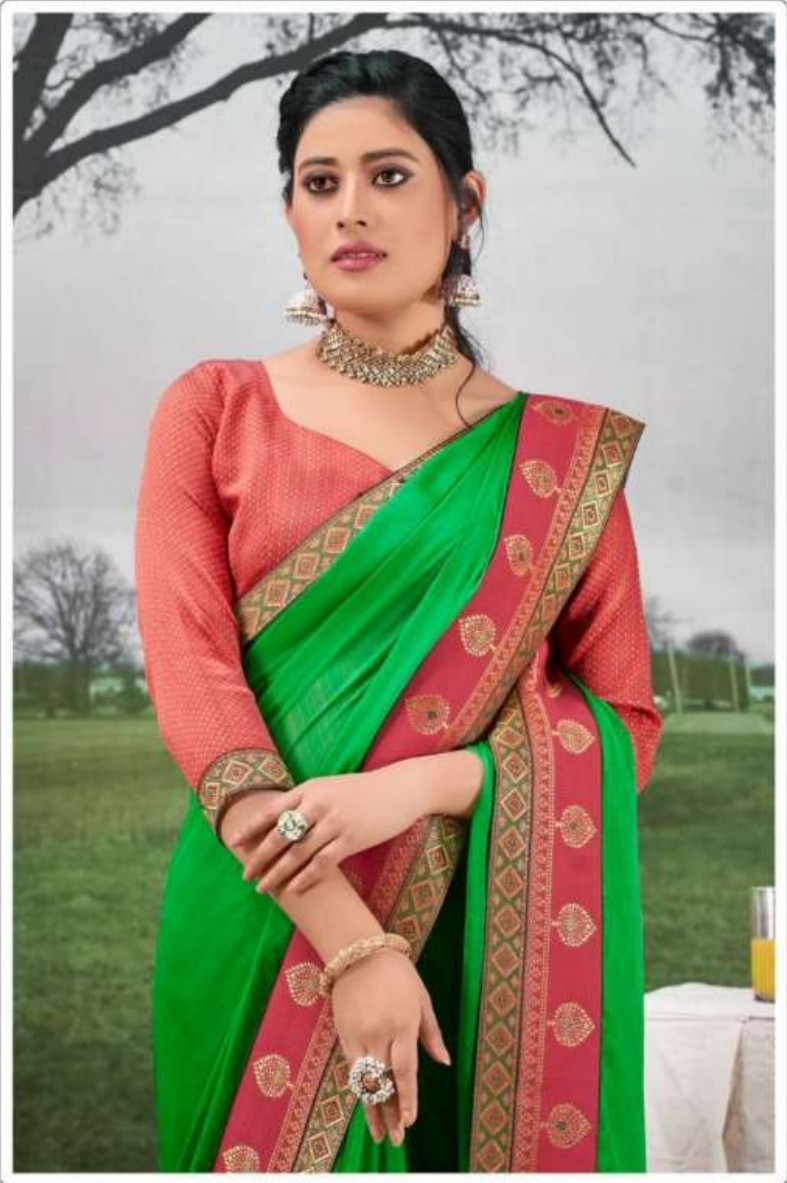
A GORGEOUS DRESS WITH CONTEMPORARY DESIGN WOULD ADD FRESHNESS AND STUNNING GRACE TO THE LOOK