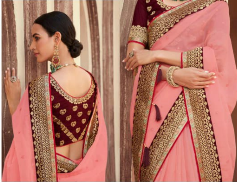
This Ethereal beauty of Madhurima collection is ready to wrap you in elegance, grace and rich traditions