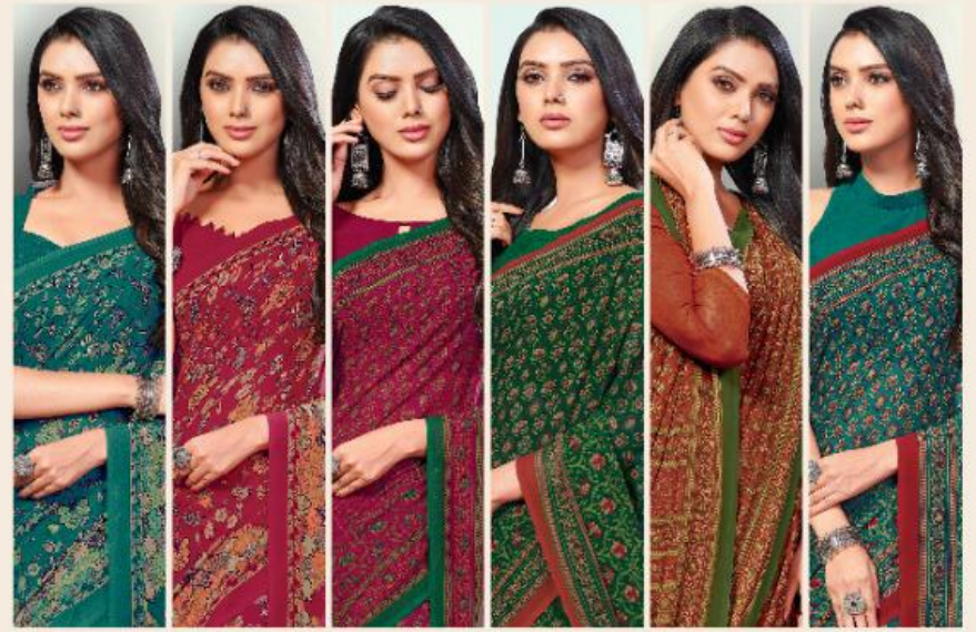
10704A 10704B 10705A 10705B 10706A 10706B