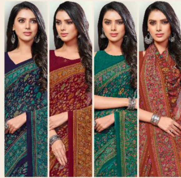
10709A 10709B 10710A 10710B