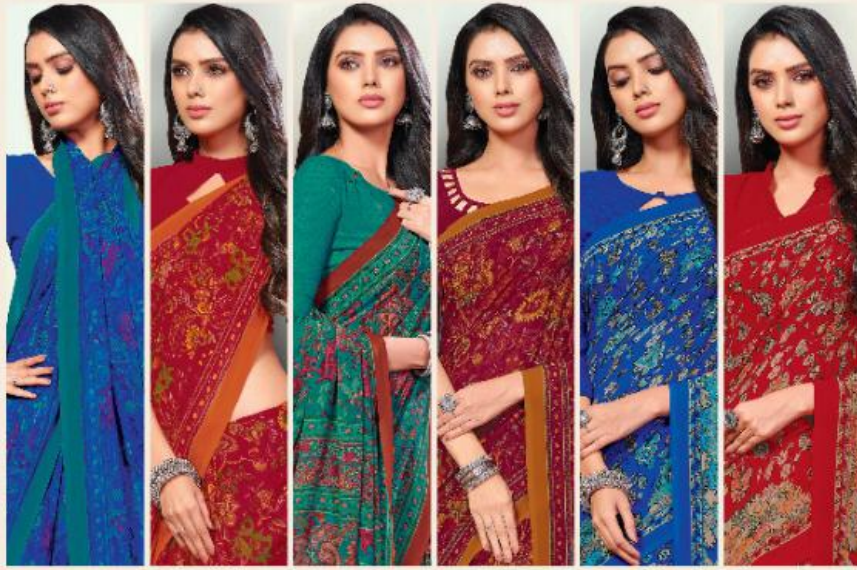
10701A 10701B 10702A 10702B 10703A 10703B