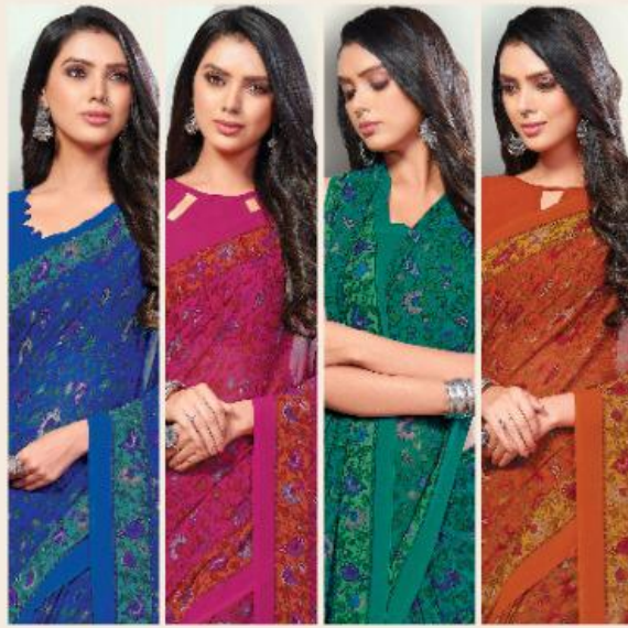
10707A 10707B 10708A 10708B