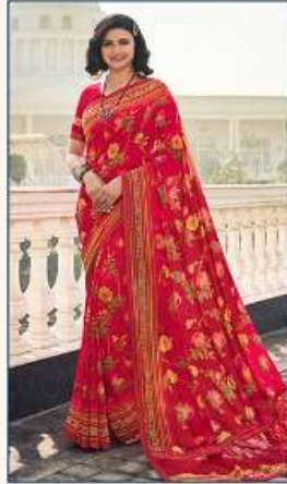
❁ 23733 ❁