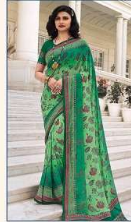
❁ 23737 ❁