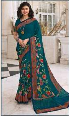
❁ 23731 ❁