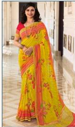
❁ 23736 ❁