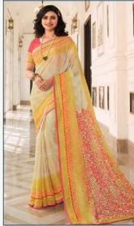
❁ 23732 ❁