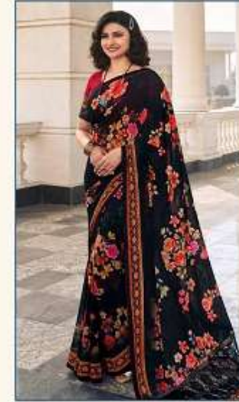
❁ 23738 ❁