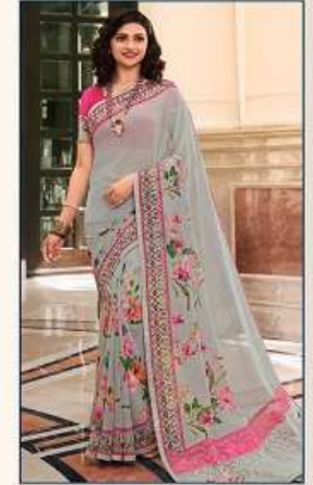
❁ 23739 ❁