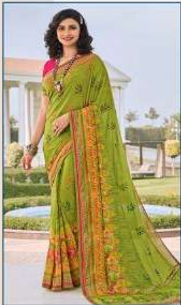
❁ 23734 ❁