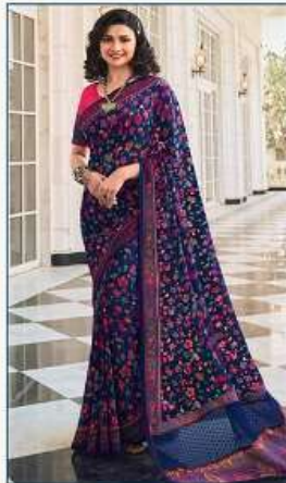
❁ 23735 ❁