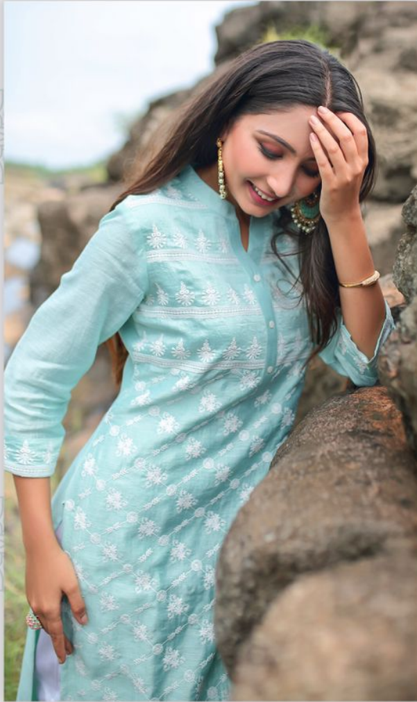
SHQV01 Sea Green - Dyed in a calming hue with embroidery, perfect for everyday wear.