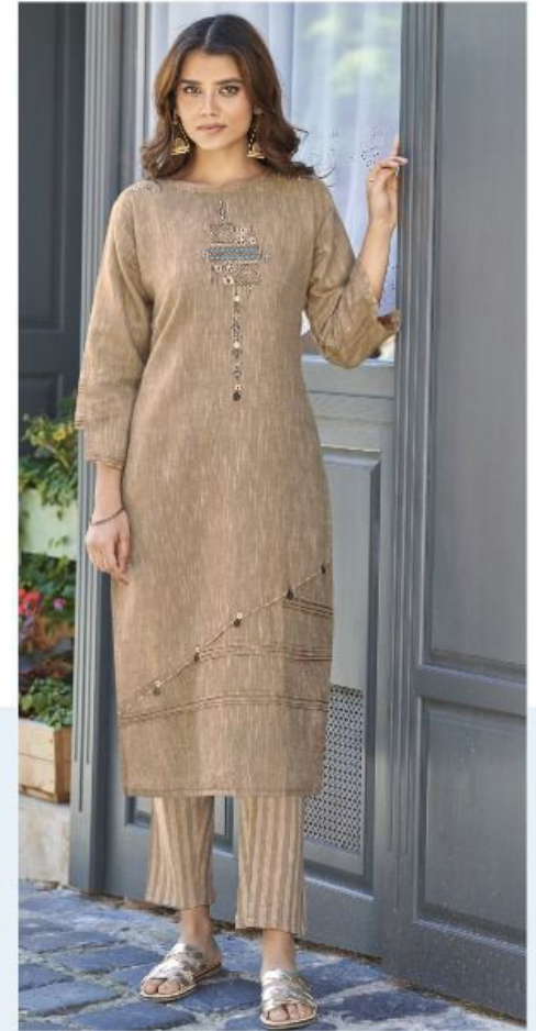
- 615 -