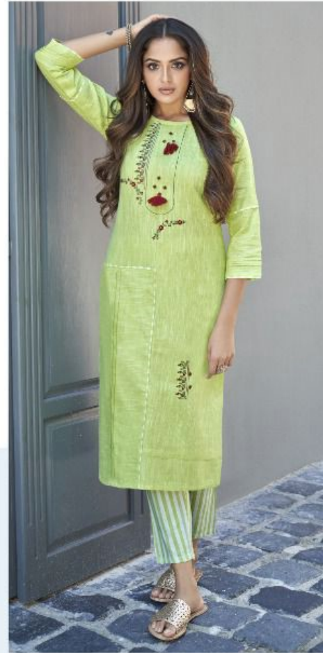
- 614 -