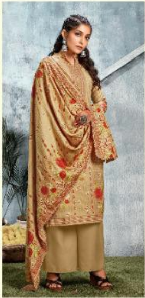
1 0 0 3