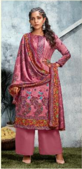
1 0 0 1