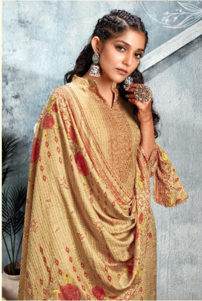
This shawl is a masterpiece and a classic illustration of modern ethnic design. It is made of a soft fabric and is adorned with intricate floral embroidery. It is perfect for those who want to add a touch of elegance to their traditional attire.