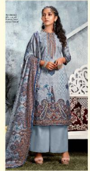
1 0 0 6