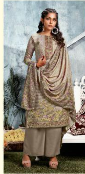
1 0 0 5