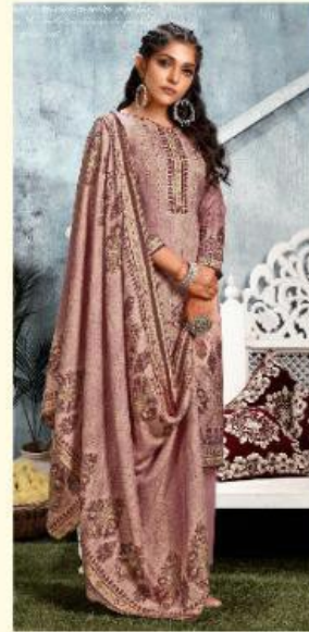
1 0 0 7