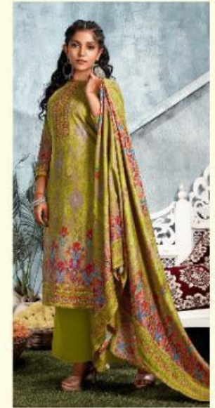
1 0 0 8