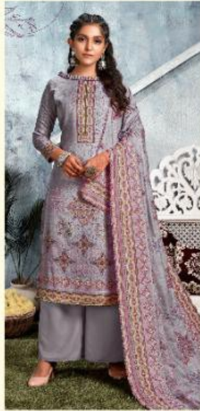
1 0 0 2