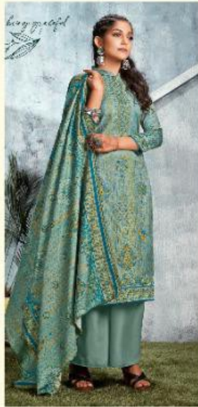
1 0 0 4