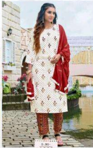
D. NO- 4005