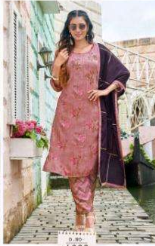
D. NO- 4002