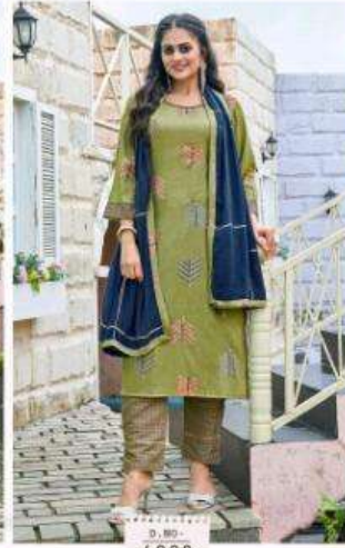
D. NO- 4003