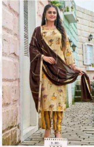
D. NO- 4001