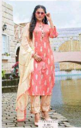
D. NO- 4004