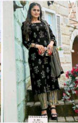
D. NO- 4006