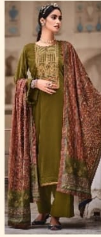
TARRUF | 3004