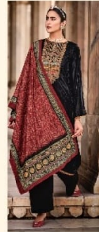
TARRUF | 3008