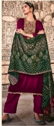
TARRUF | 3005