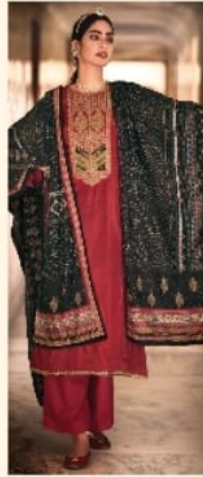
TARRUF | 3003