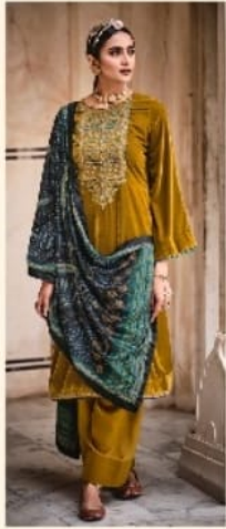
TARRUF | 3002