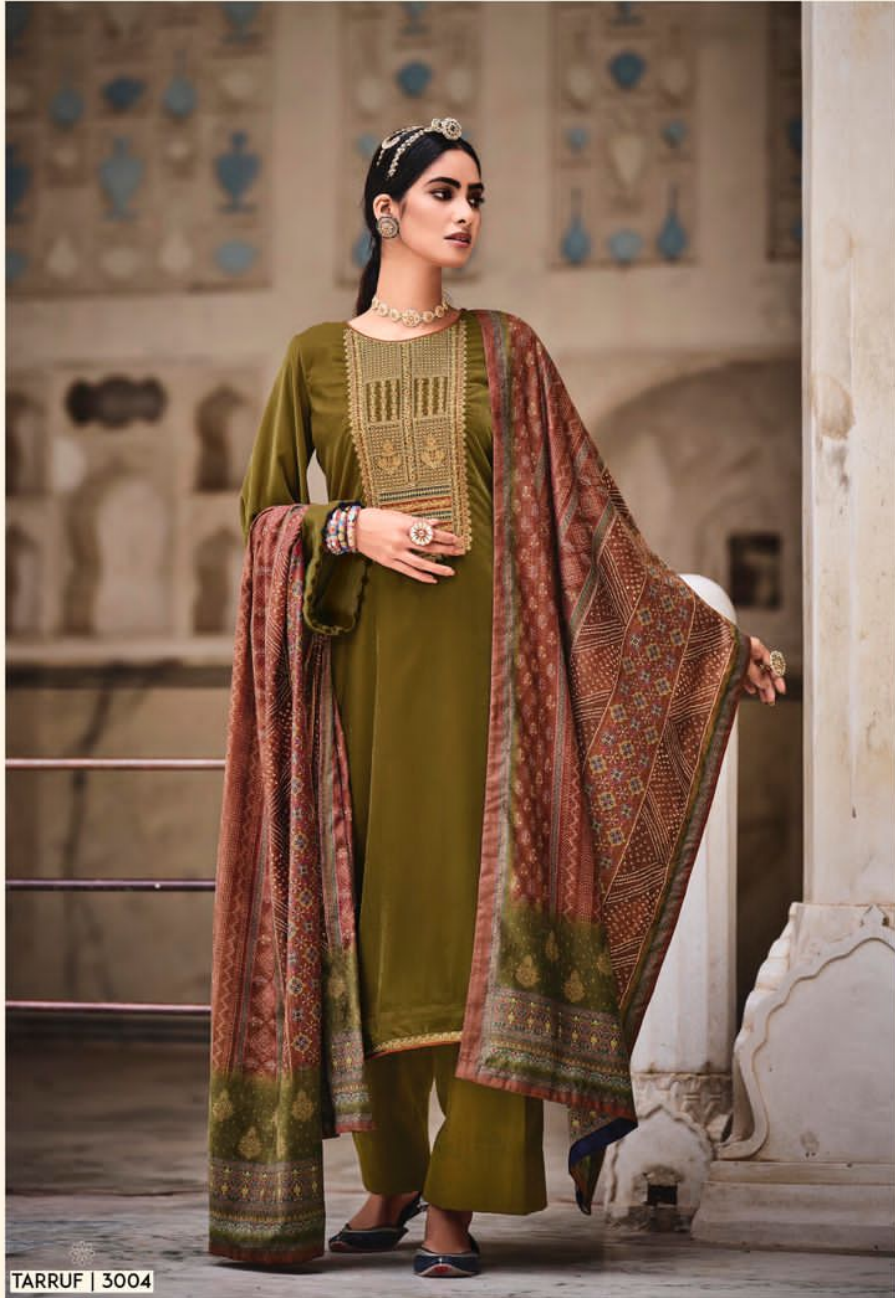
TARRUF | 3004