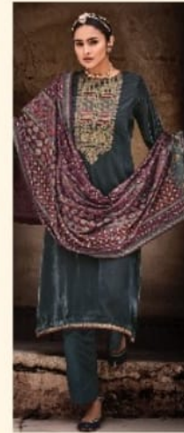
TARRUF | 3007