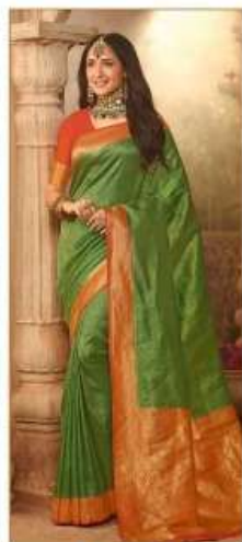
◆ 1504 ◆