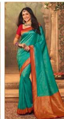
◆ 1510 ◆