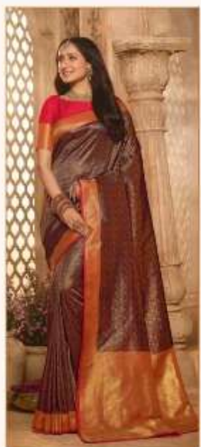
◆ 1501 ◆