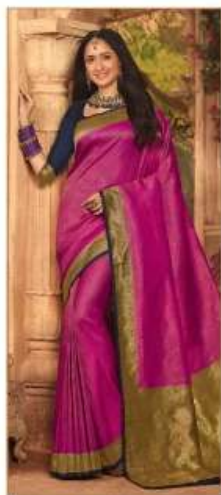
◆ 1503 ◆