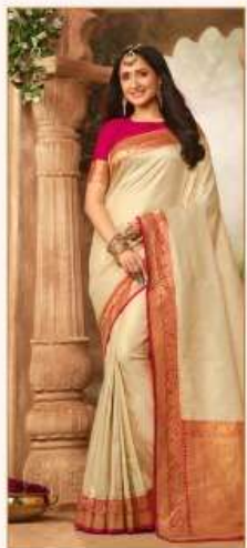
◆ 1505 ◆