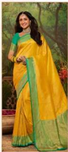
◆ 1506 ◆