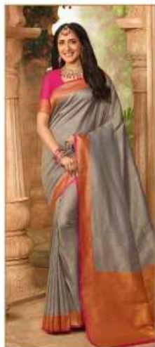
◆ 1507 ◆