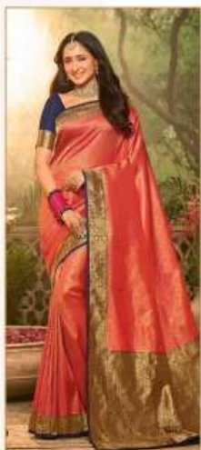
◆ 1502 ◆