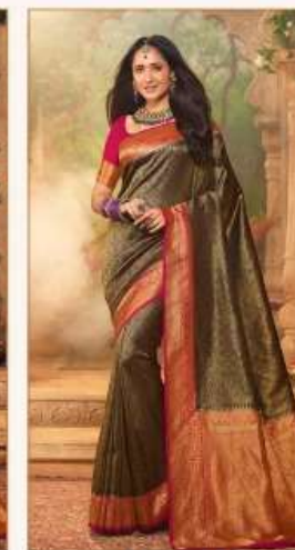
◆ 1511 ◆