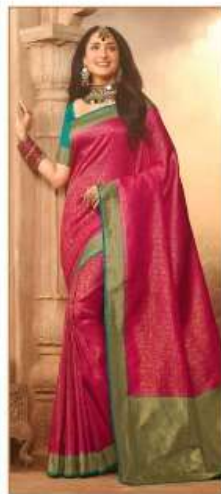
◆ 1508 ◆