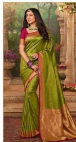
◆ 1509 ◆