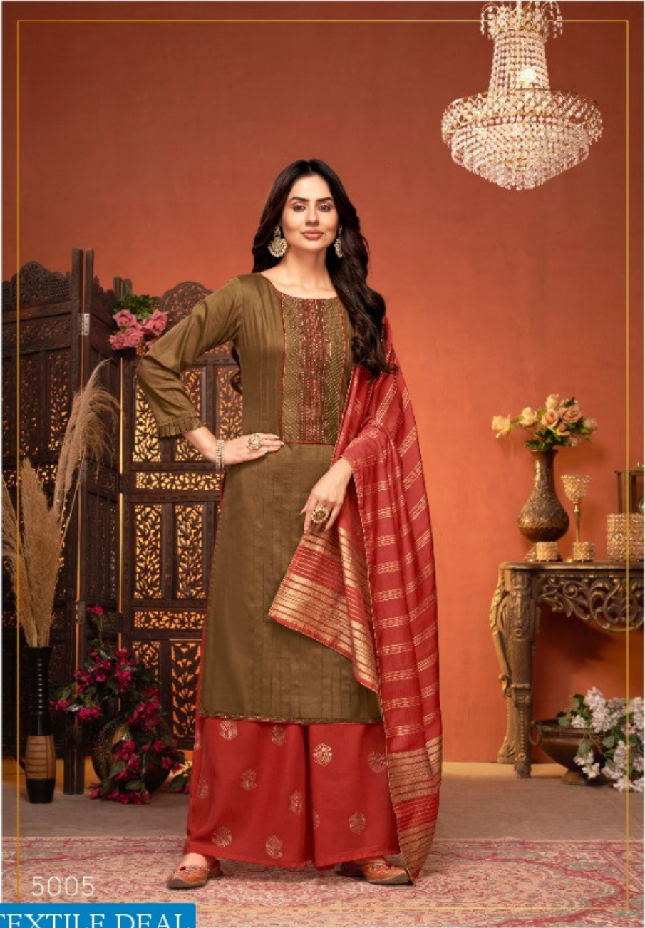
5005 TEXTILE DEAL